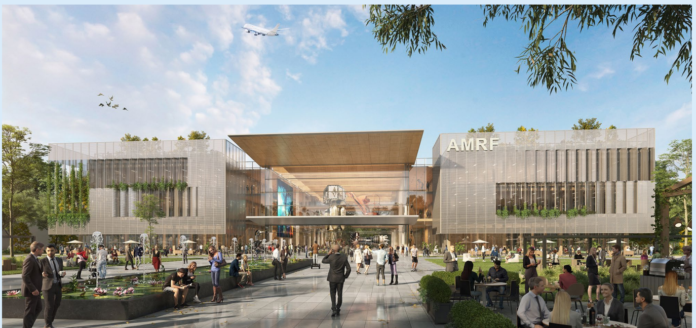
Render of AMRF

Western Sydney will continue to be the heart of Australia's high-tech manufacturing capability with the new Advanced Manufacturing Research Facility (AMRF) funded as part of the State's commitment to the City Deal. This Budget invests $10.0 million in 2022-23 ($261.9 million over 10 years) towards its establishment. The AMRF will support up to 200 direct and 1,000 indirect jobs in the Bradfield City Centre by 2032, supporting the NSW Government's commitment to deliver 200,000 jobs by 2056 in the Western Parkland City as part of the City Deal.