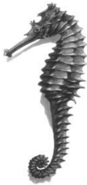
Detail from Album of natural history watercolours , Sarah Stone