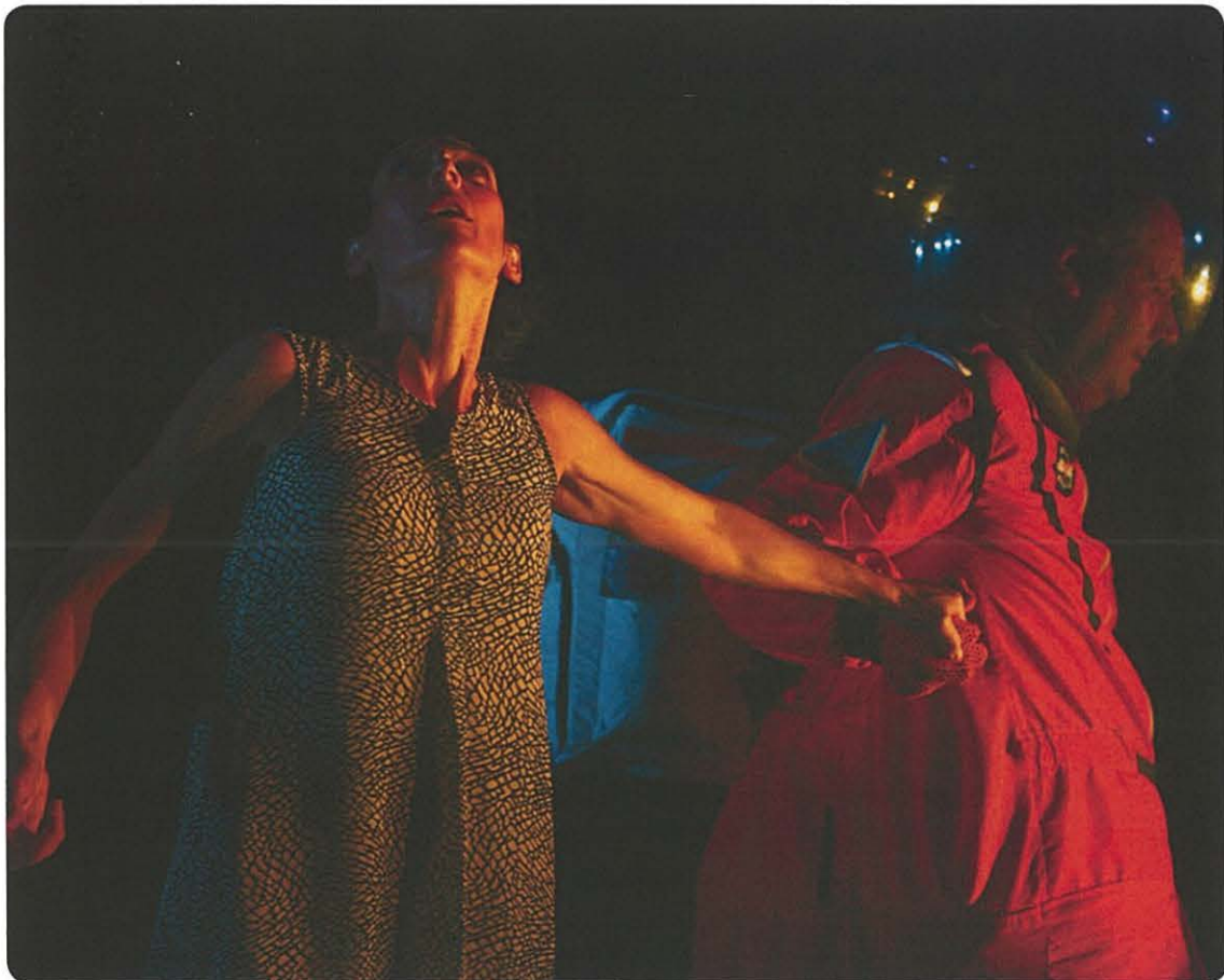
Illawarra Disability Trust's 'Altogether Drama' and Merrigong Theatre Company, part of the NSW Arts and Disability Partnership, 2014.