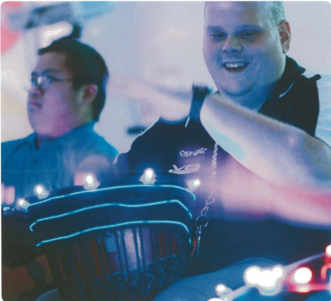
Light Rhythm Plays, NSW Arts and Disability Partnership, 2014.

These areas have been mapped against the priorities of the National Disability Strategy to ensure consistency between all levels of government.