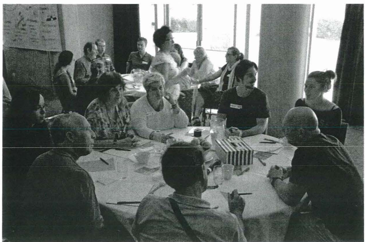
Jurors considering their remit

Forty-three individuals were then randomly selected following responses to make up a Citizens' Policy Jury of people not representing any political party, lobbyists or interest groups, ensuring a mix (matched to the census data) of age and gender.