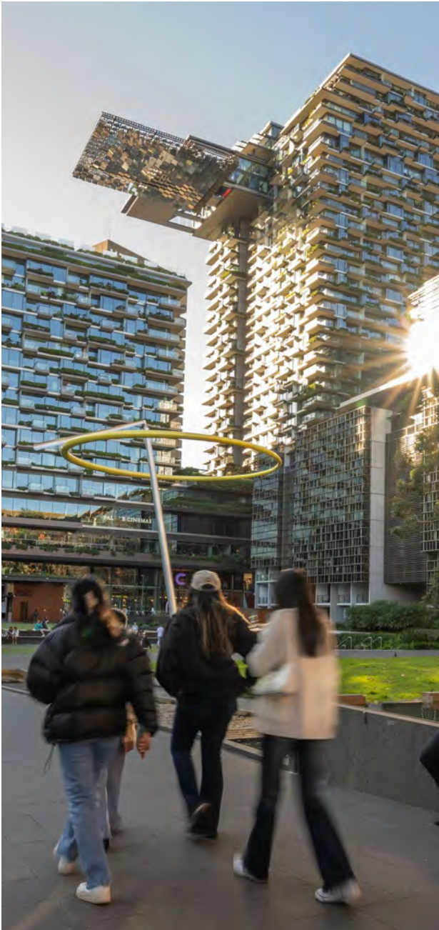
The built environment will be a focus area of the new Net Zero Plan.

The Net Zero Government Operations Policy has new requirements for the built environment sector. This includes requiring that from 1 July 2026, all new office buildings commissioned for, or by, the NSW Government must be all-electric.