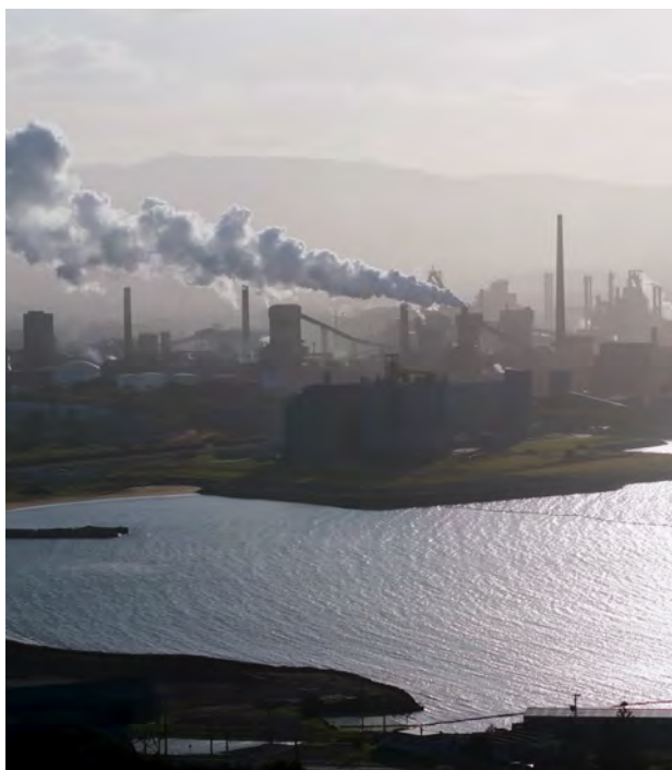
The NSW Industry Policy reinforces the NSW Government's commitment to a thriving low-carbon industrial sector.