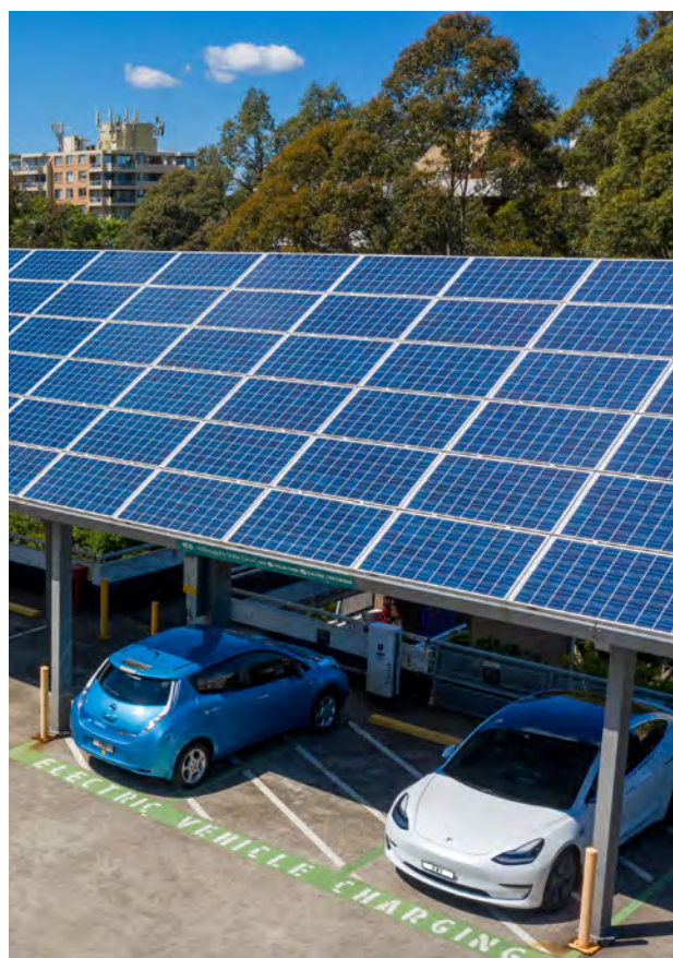
Passenger and light vehicles are responsible for more than half the transport sector's emissions.

In December 2024, the NSW Government ordered 319 battery electric buses as part of the department's Zero Emission Buses Program.