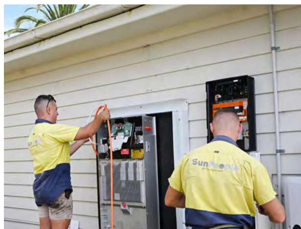
More than 11,000 batteries were installed in NSW between November 2024 and May 2025 under the NSW Peak Demand Reduction Scheme.

More consumer energy initiatives are covered below in the discussion of the built environment.