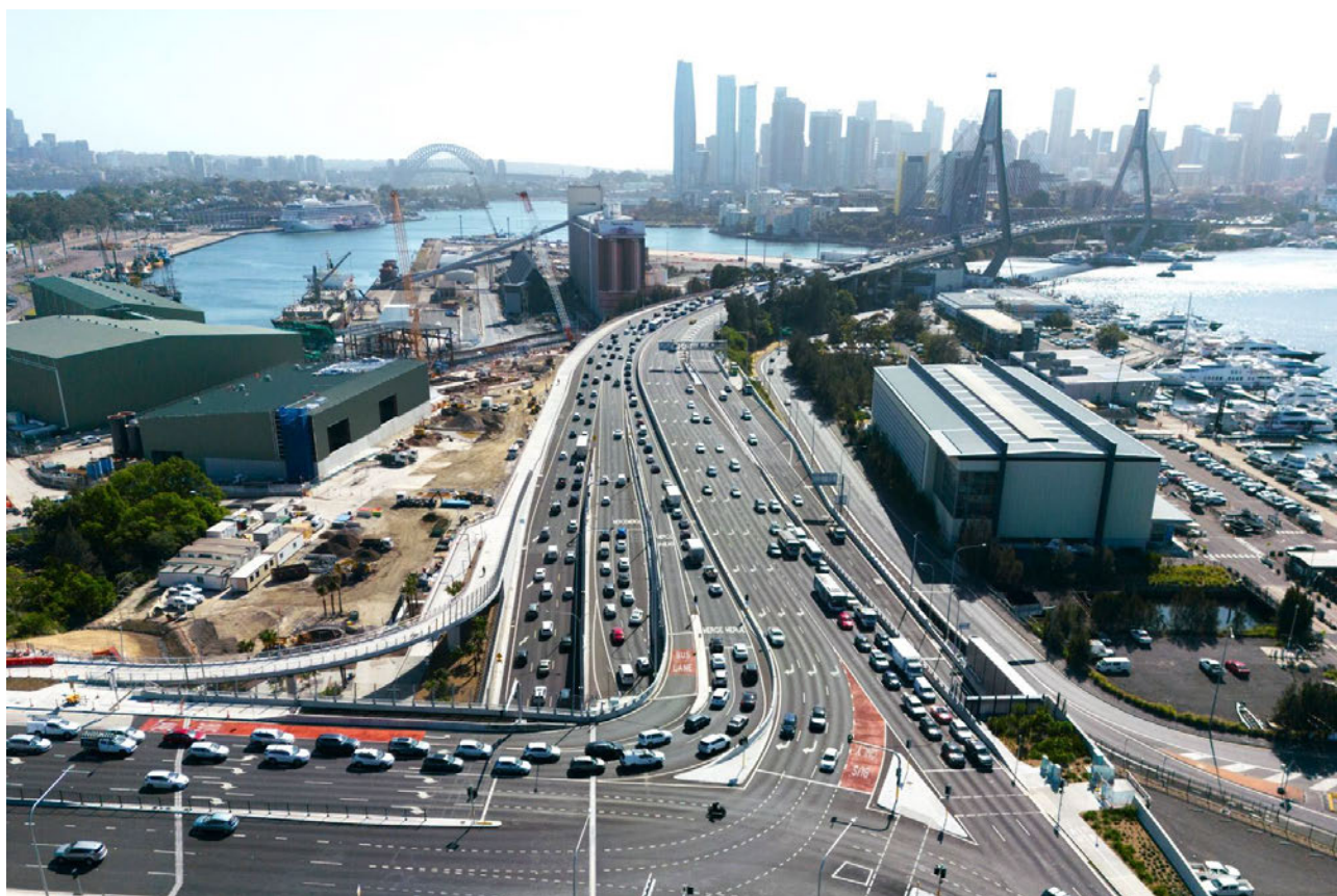
Figure 1: The community was promised that the Rozelle Interchange would be mostly underground but the impact on the Inner West at surface level is profound. The failure of recent transport planning has been exposed. No modern, forward-thinking city should have roads like this on the edge of the CBD. Especially not roads built in the 2020s!

The 'opportunity cost' is also huge. Hectares of land consumed that can no longer be used for housing and parks. Billions squandered that could have set Sydney up with the most amazing bicycle network, and rebuilt footpaths to improve comfort and safety of walkers. Another generation of children denied healthy, low-cost ways to move around. The chance to make real progress on Net Zero targets to decarbonise transport.