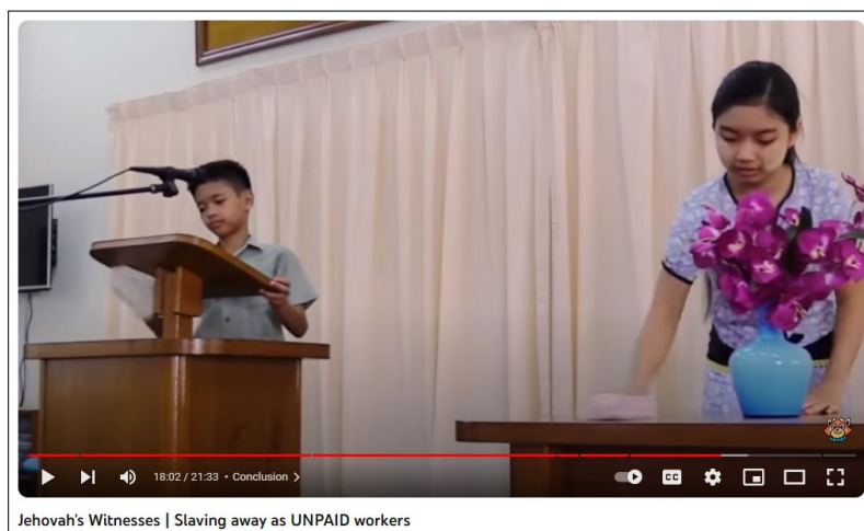
Figure 3 Two children working as child slave labourers

In June 2023, I saw a video showing recent Jehovah's Witness propaganda that featured one of the new Jehovah's Witness Governing Body leaders, Jeffrey Winder. In the video, two children are cleaning the podium and a table in a Kingdom Hall (minute 18:02), then two more young girls are cleaning chairs in other Kingdom halls (minute 18:09 and 18:21), and then a boy is being indoctrinated to clean the floor (minute 18:23). 17