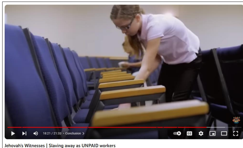
Figure 5 Another young girl cleaning as a child slave labourer