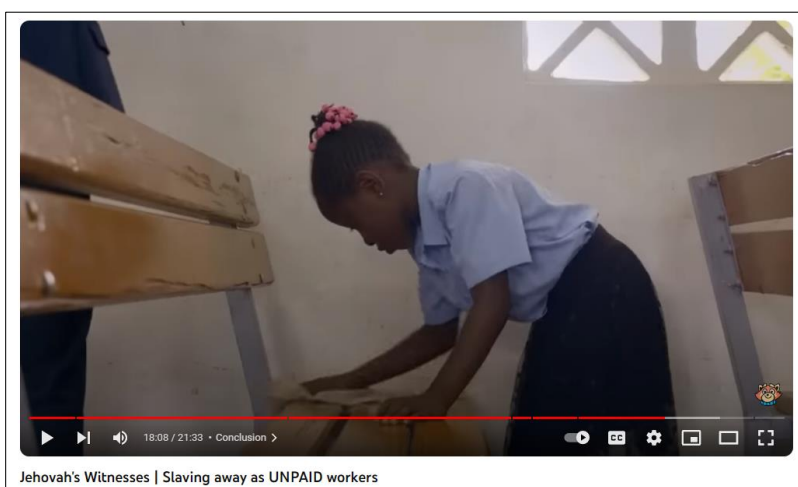
Figure 4 A young girl working as a child slave labourer