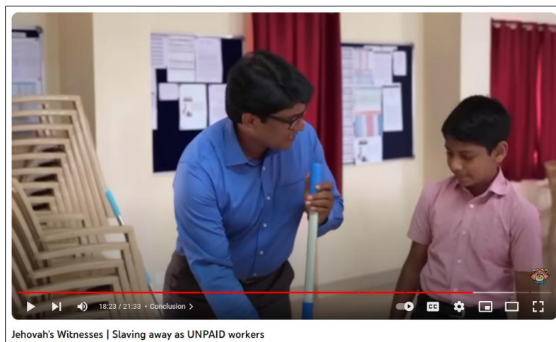
Figure 6 A young boy being indoctrinated to clean by a Jehovah's Witness adult