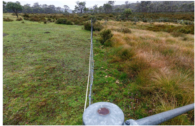
Compare the pair: Exclusion fencing reveals the extensive impacts of grazing by feral horses in Kosciuszko National Park - 2020