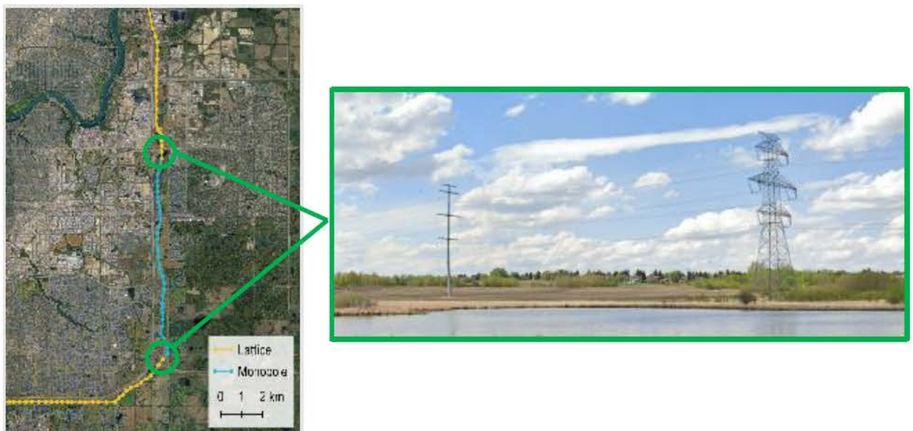
Figure 1. Monopoles used in 10km of transmission line to gain community support.

The Heartland Transmission Project saw the construction of a new 65km double-circuit 500-kV transmission line through the city of Edmonton. Part of the new line was aligned through densely populated areas and green corridors, which resulted in high levels of public scrutiny. Businesses, homeowners, school boards, environmental lobbyists and other stakeholders voiced their concerns and contested the development. Extensive feedback was collected through public consultations and open houses held in the project vicinity, highlighting the community's desire to preserve visual amenity. Accordingly, a roughly 10km section of line was constructed with monopoles, rather than traditional lattice towers, to meet the community's expectations. This design choice was also able to satisfy the robust reliability and availability requirements of the network operator and survive the harsh seasonal conditions of the local environment.