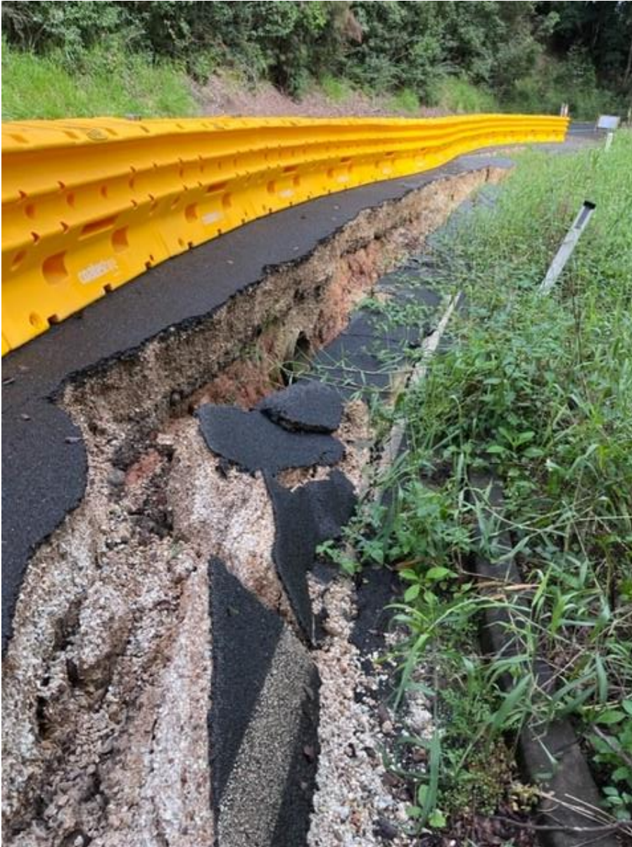
Figure 4 - Tyalgum Road