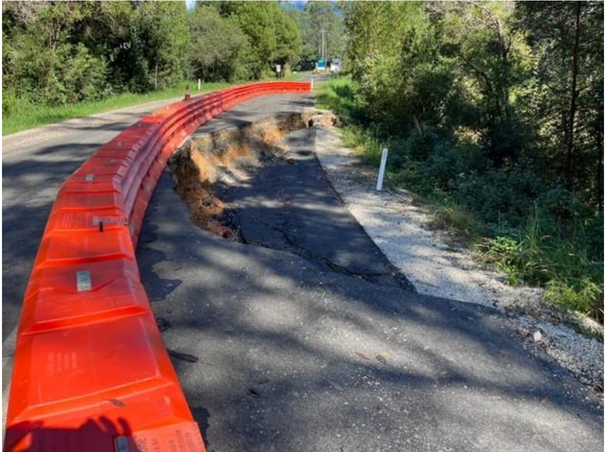
Figure 8 - Zara Road opposite Charbray Place