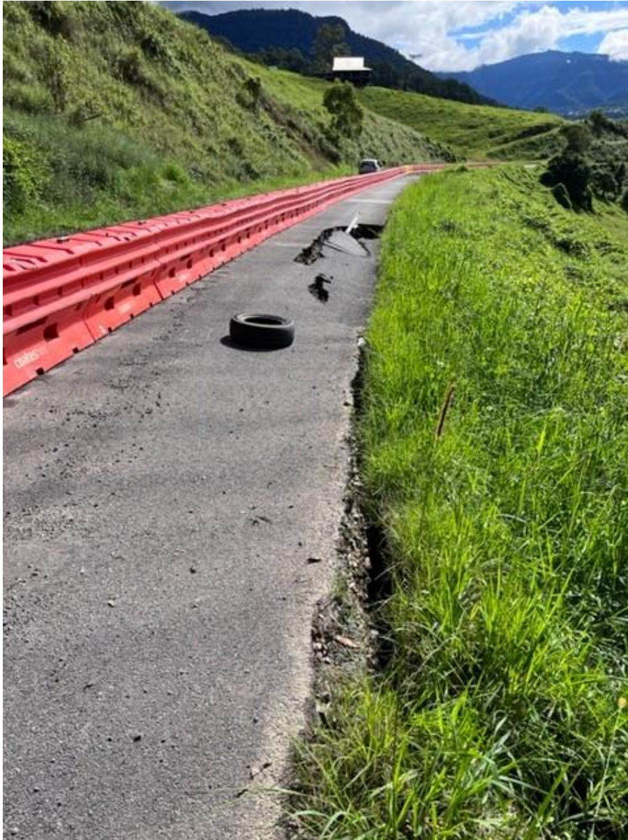
Figure 7 - Zara Road