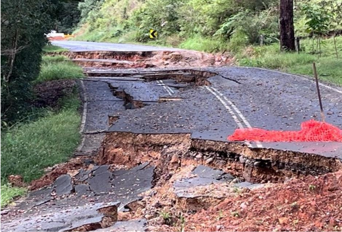
Figure 1 - Tyalgum Road

Attachment 3. Photos of the main landslip on Tyalgum Road, the secondary Landslips on Tyalgum Road and landslips on Zara and Numinbah Roads.