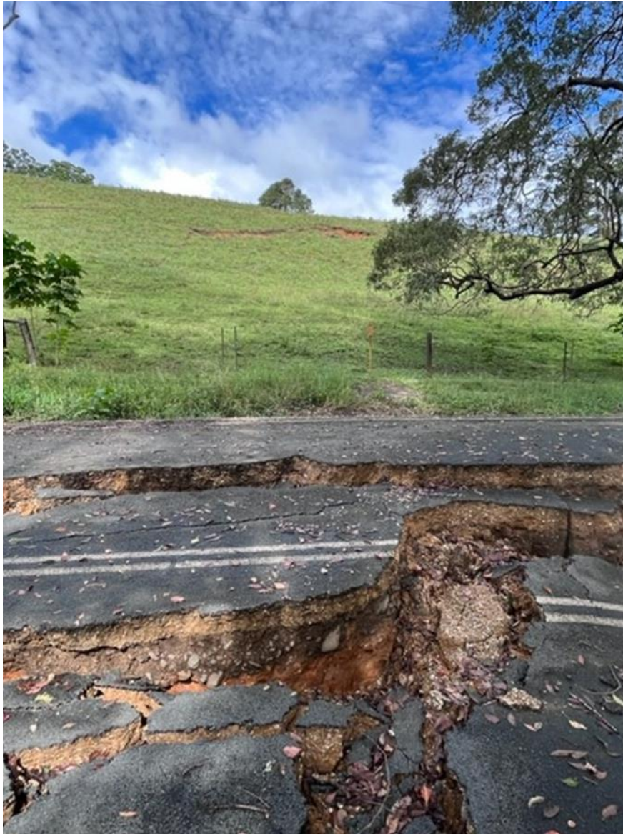
Figure 3 - Tyalgum Road