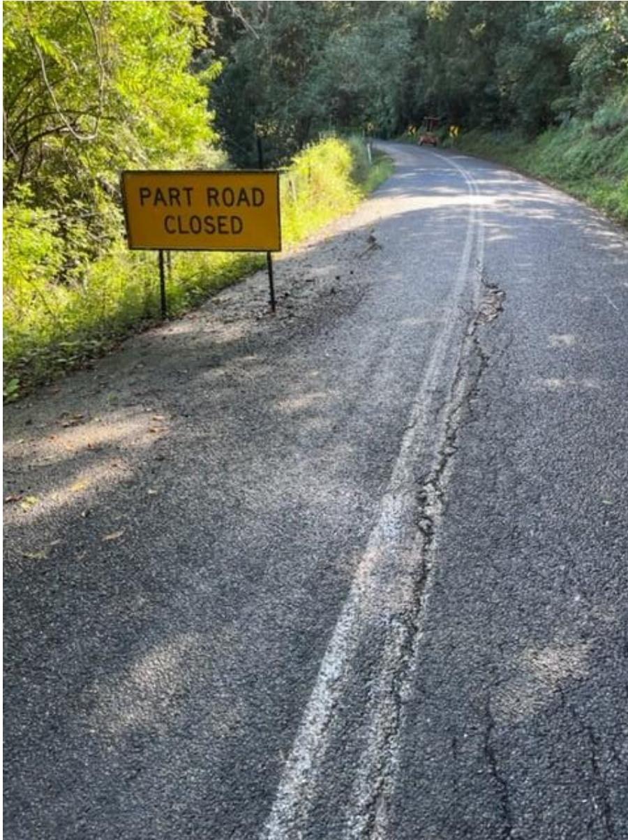
Figure 5 - Numinbah Road