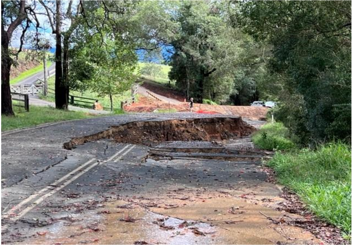
Figure 2 - Tyalgum Road