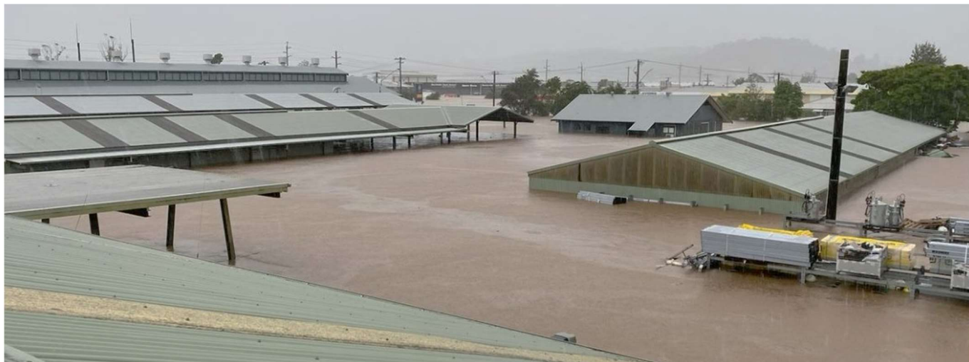
Photo: Essential Energy's Lismore Depot on 28 February 2022

Essential Energy infrastructure sustained significant flood damage across the network from the Tweed Valley to the Coffs Coast. Essential Energy's Murwillumbah and Lismore depots both experienced significant structural damage to the buildings, electrical infrastructure and equipment that was stored at these depots. The Lismore depot was completely submerged in flood water during the first flooding event in February, and then was flooded again during the second flooding event in March. As such, the Lismore depot will require a permanent relocation due to the extent of the damage and likelihood of future flooding. A temporary depot was set up at the Lismore Workers Sports Club.