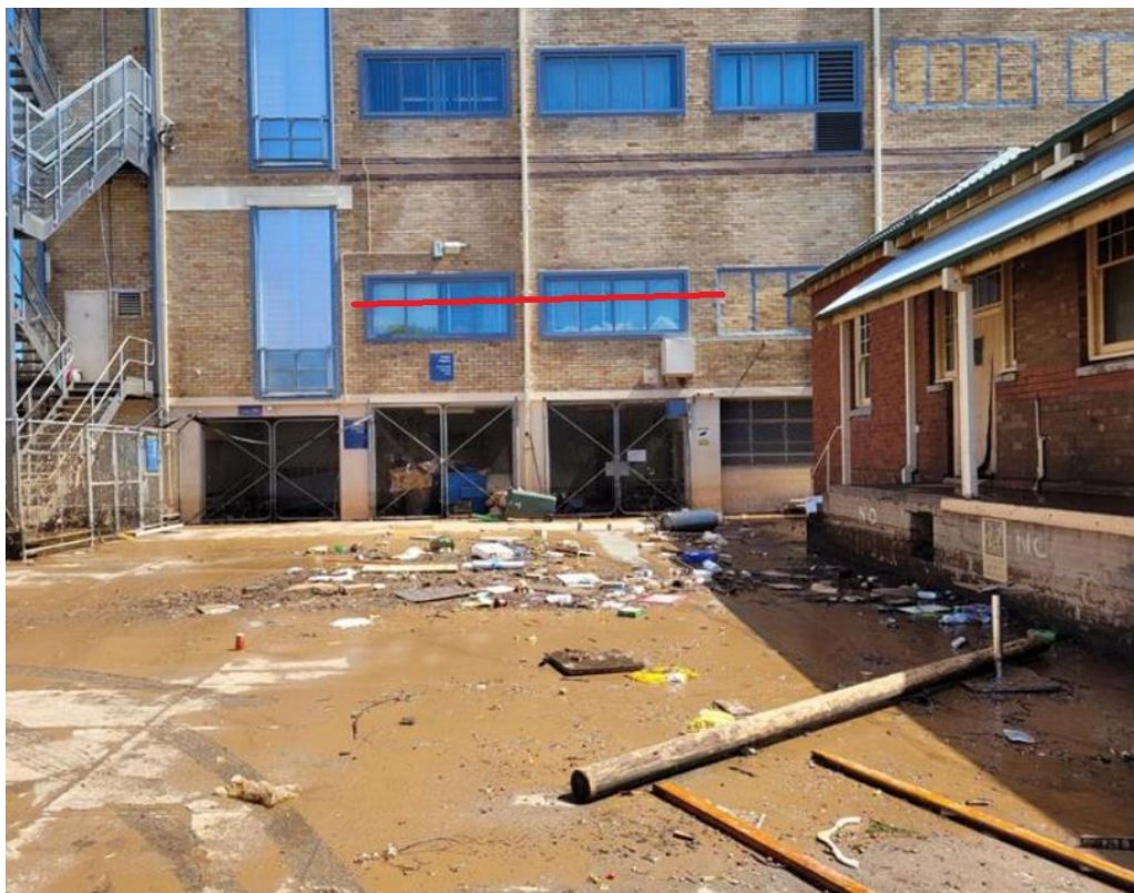
Figure 6: Lismore Exchange after flood waters had receded. The red line shows the high-water mark.

Flood levels at Lismore peaked at 14.5m; the levy is only 10m. This significantly impacted the Telstra Lismore Exchange which connects fixed line telephone, broadband and supports mobile services in the Lismore region. Telstra's Lismore exchange ground floor and half of the first floor were inundated with water – See Figure 6. This affected power and other facilities such as air-conditioning. The first floor also contained our transmission equipment linking Lismore to our wider network. Fibre washouts in the surrounding areas further affected Lismore connectivity.