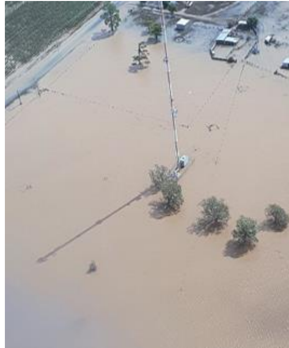
Figure 7: Aerial view of the inundated mobile base station at Buckendoon.

This reinstated mobile coverage on 12 March. This temporary mobile solution will stay in place for several months to allow the original mobile site at Buckendoon to be rebuilt. We note Woodburn was declared a community in isolation from 2 March to 8 March inclusive as PSTN services were also disrupted during this time. Once PSTN services were restored on 8 March, the community in isolation status was removed.