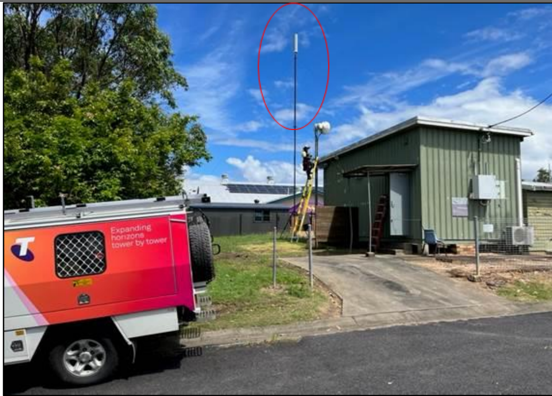
Figure 8: View of the Woodburn Exchange with the antenna of the COW visible behind the exchange building (red circle).

Mullumbimby. While Mullumbimby was declared a community in isolation from 1 March to 7 March due to a loss of both mobile and fixed line communications, both were reinstated through a combination of hardware replacements and optical fibre cable repairs by 7 March. Following reinstatement of mobile coverage to the community, the mobile tower within the community was set alight in what is being investigated as a potential arson attack. The damage caused by the fire in the early hours of 18 March impacted all mobile coverage to the Mullumbimby community.