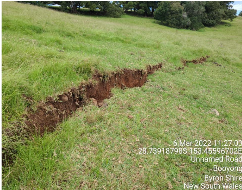
Figure 1: Land slip in Booyong NSW that damaged an optic fibre cable.

Flood related damage can be very difficult to locate. Land needs to only slide or shift a few tens of centimetres to damage optic fibres and locating the site of the land slip can be very challenging along a route that can be several kilometres long, as per Figure 1 below. 1