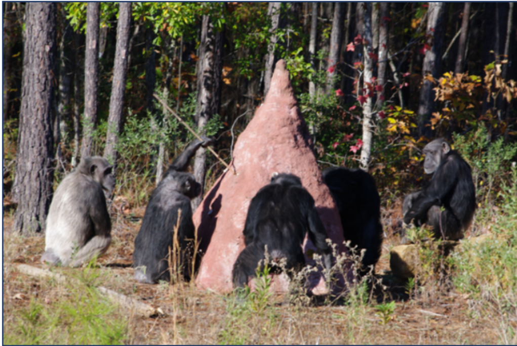
The partly government-funded Chimp Haven in the USA provides an enriching “retirement” for primates that were used in government testing facilities.

If Australia wishes to be considered a world-class centre of research, specifically in biotechnology and life sciences, it needs to align its approach to global leaders in government and research that are embracing greater openness, public engagement, reduction in the use of animals and ethical options for animals post-research that are a true collaboration between not-for-profits, governments and the animal-based research industry.