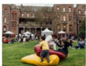
Fetes or community festivals