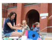
Activities for children and family