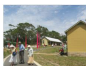
Heritage interpretation centre