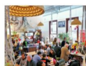
Café or restaurant