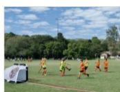
Sport & club amenities