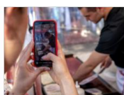
Artist and maker spaces