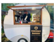
Kiosk and outdoor bar