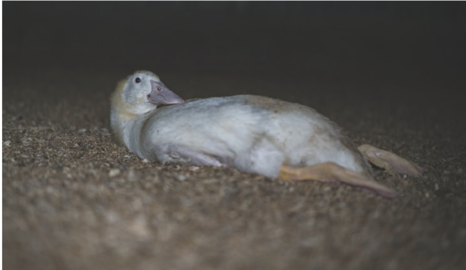
Duck in grower shed, Victoria, Australia.

To further consider an example of cruel practices, the duck shown here is from an Australian duck farm. As frequently occurs, he is on his back in a shed, unable to move.