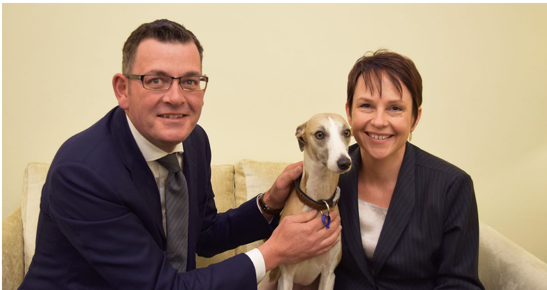
Victorian premier Daniel Andrews and former minister for agriculture Jaala Pulford appearing in the government's announcement of an inquiry into puppy farming

From 10 April 2020, approved commercial dog breeders will be limited to a maximum of 50 fertile female dogs.