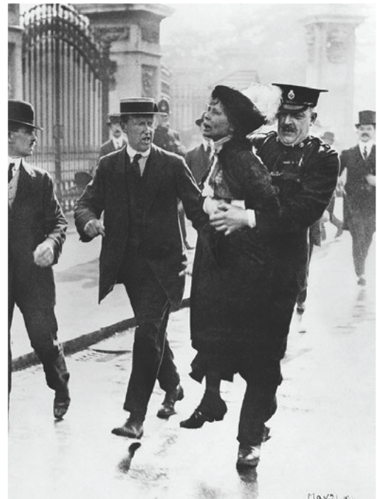
Emmeline Pankhurst arrested outside Buckingham Palace 1914

The London statue was unveiled in 1930 by Prime Minister Stanley Baldwin, who had opposed her cause. Musicians from the Metropolitan Police, some of whom had arrested suffragettes during demonstrations, asked to play for the ceremony.