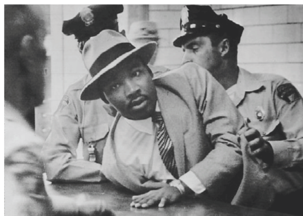
Dr Martin Luther King, Jr. being arrested in Montgomery, Alabama, for "loitering" in 1958

Through vigils, protests and demonstrations over several years, King was arrested and jailed many times.