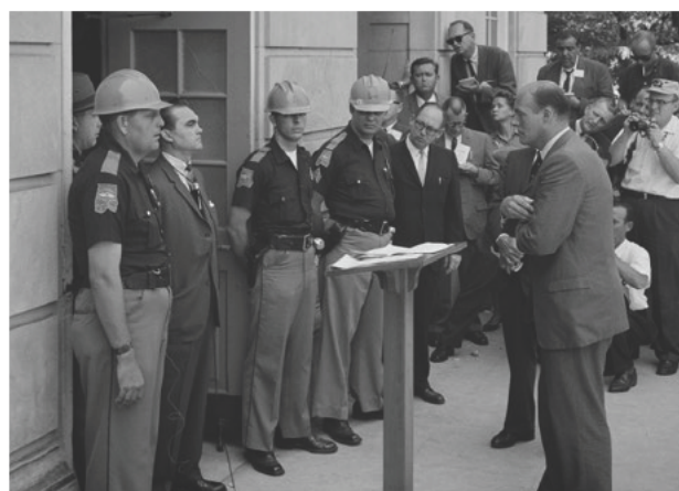
Governor George Wallace attempting to block integration at the University of Alabama, June 1963