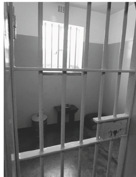
Nelson Mandela's cell at Robben Island, the prison where he spent 18 years of his 27-year incarceration.

On his return later that year, he was arrested and sentenced to five years in prison for inciting workers to strike and leaving the country without a passport. A subsequent trial for sabotage resulted in a sentence of life in prison.