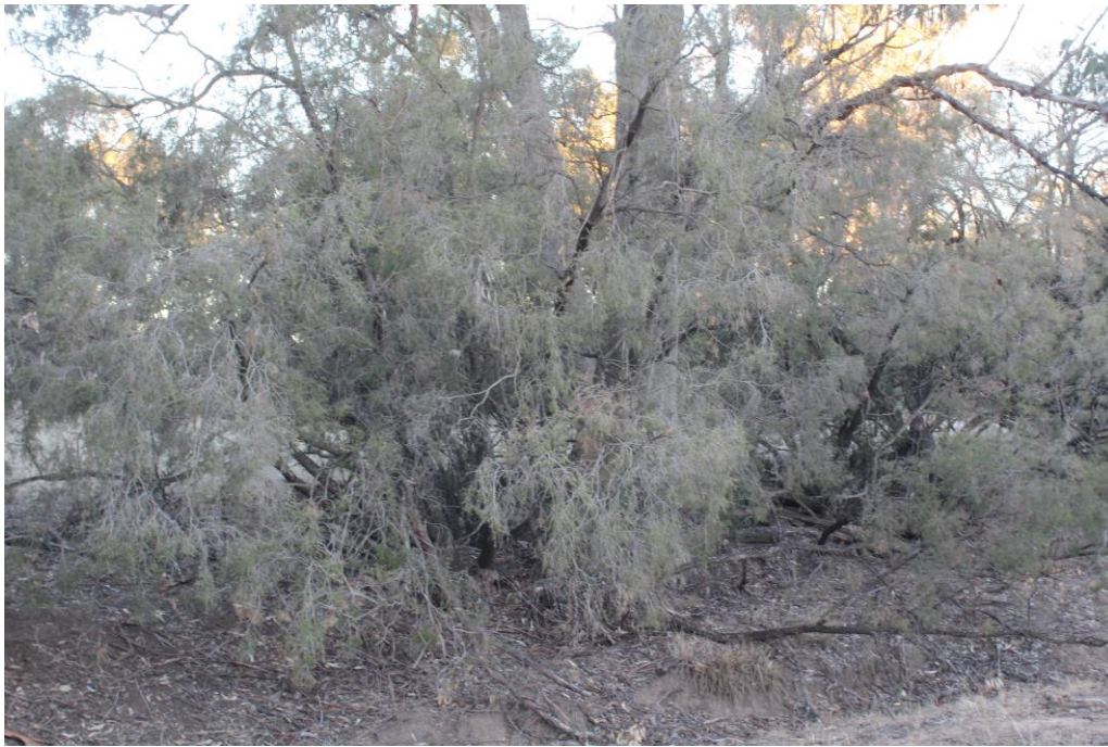
Melaleuca trees dying, deprived of surface water flow due to 'surface water capture' by a coal company.

Water is one of the essential elements that will in the future sustain the habitat needed for our Koala population. When the Eucalypt trees are struggling to survive due to lack of water, the Koala population also feels that effect as the leaves no longer have the moisture that they need. It is not just food trees that are dying, many species of shade trees are also deprived of water and dying.