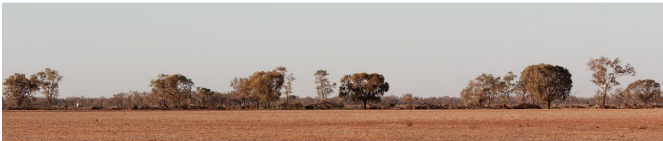
A line of mature trees being cleared.

Clearing and logging on private property is out of control since the Biodiversity Conservation Act 2016 was introduced in August 2017 and came into force. It was rushed and conservation was watered down so clearing for wide acre farming was easy and uncomplicated. Compliance will always be a nightmare, in the light of the murder of an OE&H compliance officer at Croppa Creek. Local Land Services (LLS) are now in a position to advise landholders of the Act, they are sitting in the middle, on one hand advising property owners of where and what they can clear, and on the other side of the coin they are supposed to be protecting the Environment and habitat, when Mapping is not even accurate. Most LLS staff live in the areas where they work and must feel compromised trying to do the right thing by the landholder and on the other hand protecting the Environment.