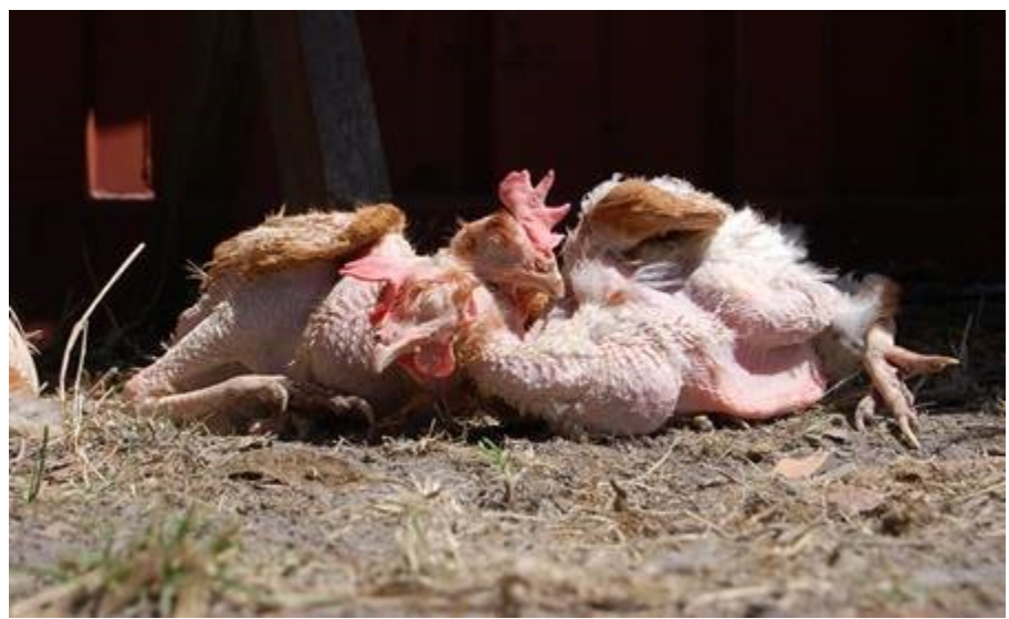
Photo: Two rescued battery hens rest peacefully in the sunshine for the first time.

https://www.newscientist.com/article/dn14214-secret-sleep-of-birds-revealed-in-brain-scans/#.XSlaoK9cndF.email