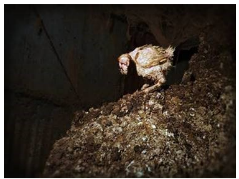
Photos: "Egg Corp Assured" 'state of the art' PACE farm factory, NSW, August 2014 Dozens of hens found abandoned among enormous towers of rotting faeces beneath the long rows of cages, stacked vertically up to six rows high.

- 4 out of every 5 hens suffers from crippling bone disease osteoporosis. Studies reveal many suffer from metabolic fatty liver disease, broken bones, and chronic pain.