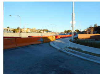
Parramatta Road, at Chandos Street, Ashfield, 12 August 2018