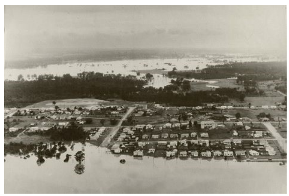
Flood 15.1 meters 1961