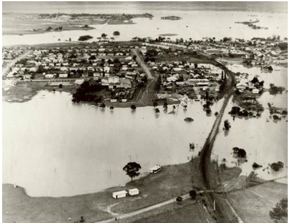
Flood 15.1 meters 1961