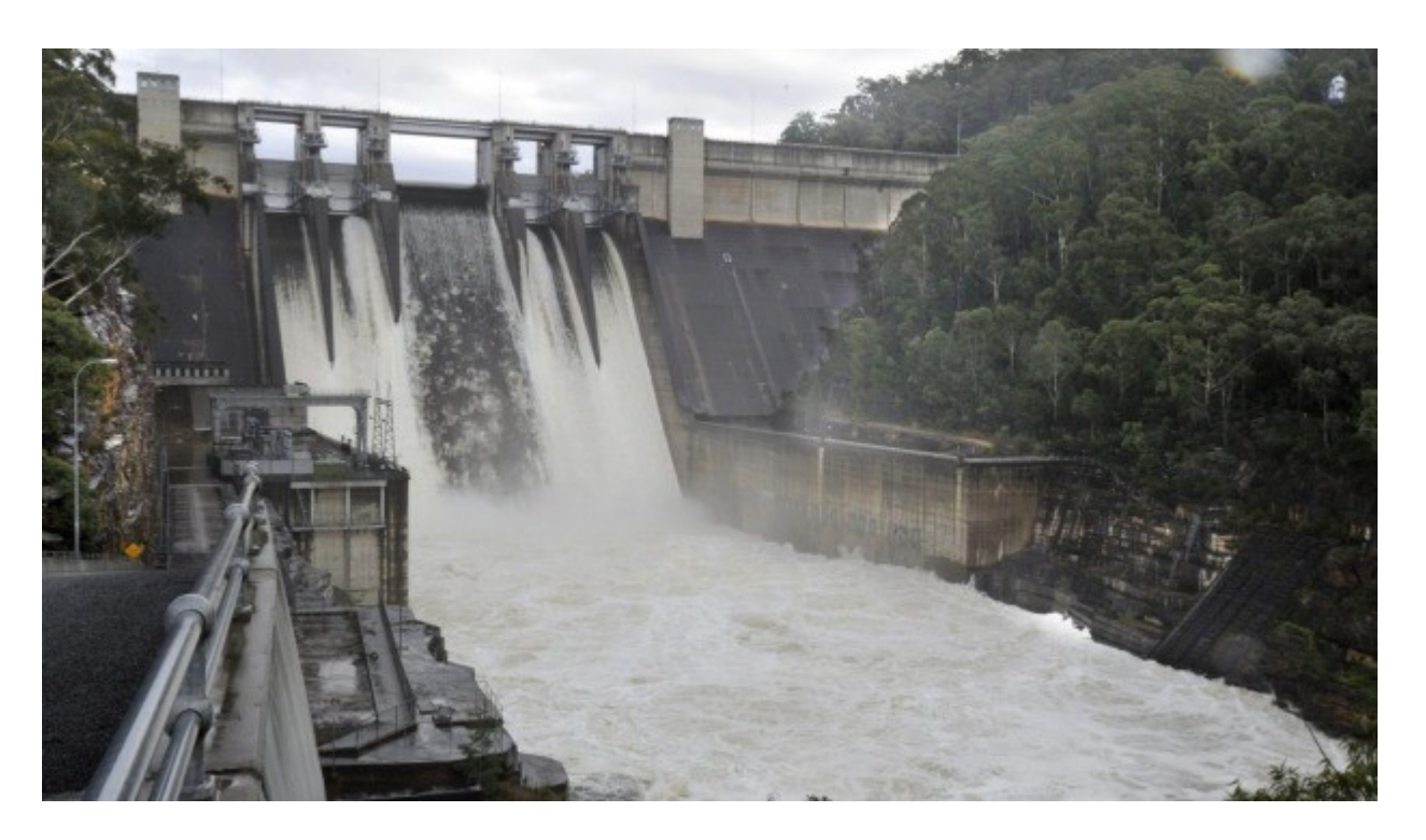
RAISE THE WALL AND SAVE US ALL Bill to protect Life and Property in the Hawkesbury Nepean Valley to be introduced into NSW Upper House.

A Bill to be introduced into the NSW Upper House of Parliament this week allowing the controlling Authority over Warragamba Dam, Water NSW, the legislative authority to operate Warragamba Dam for Flood Mitigating as the current legislation only allows for Water Storage.