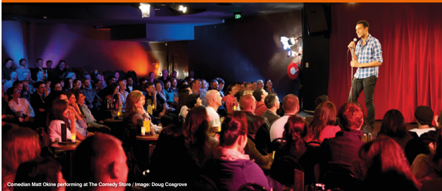
Comedian Matt Okine performing at The Comedy Store