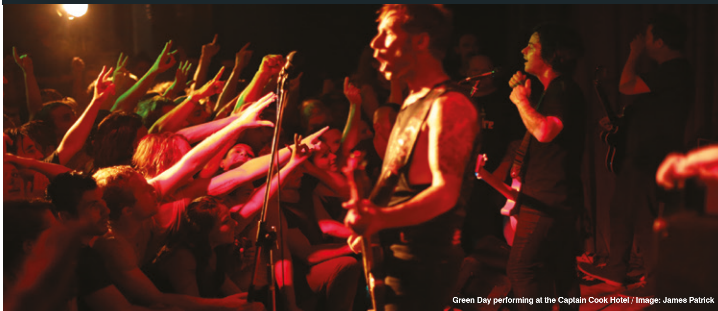
Green Day performing at the Captain Cook Hotel

In addition, APRA|AMCOS and Ernst and Young recently undertook a survey of venues that program live music and those that do not but would consider it. 49 In response to the question: 'What would encourage you to stage more live music performances at your venue?' around two thirds, (64.9 per cent) of respondents nominated 'a reduction in the overall cost to stage live music'. When asked what specific costs were the most prohibitive, 'cost of hiring and promoting live music' was identified by the majority of respondents, followed by 'cost of equipment: p.a., staging, lighting etc.' and then 'cost of noise amenity or renovations'. Taken holistically, this research suggests that any program focused on providing financial assistance to venues should not rely on architectural sound attenuation as a 'silver bullet', and that funding or loan programs aimed at making live music and performance a more attractive option for venues need to include support for a range of costs involved in setting up a venue or introducing live music programming, such as moveable equipment (p.a. systems, mixing desks) and/or reconfigurable fittings (staging, seating), and not just sound attenuation measures.