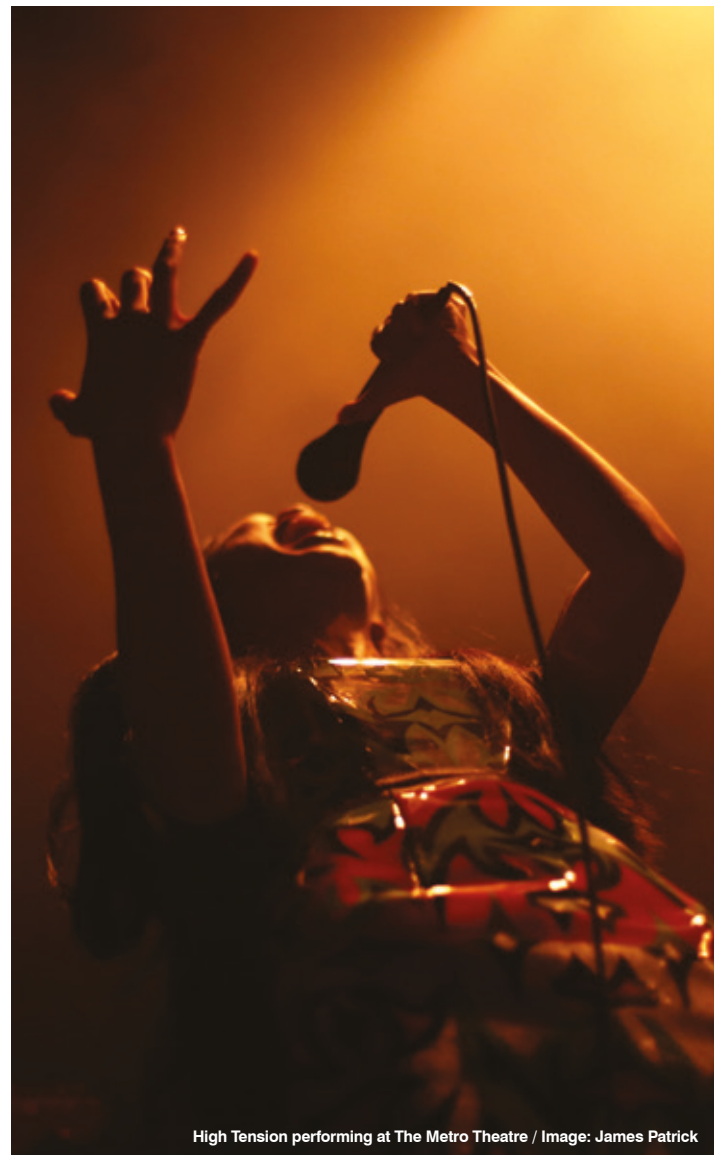
High Tension performing at The Metro Theatre

Following the 60-day public exhibition period the City received submissions from the community. These submissions were reviewed and a number of changes made to the Taskforce’s initial recommendations in order to finalise the City of Sydney Live Music and Performance Action Plan .