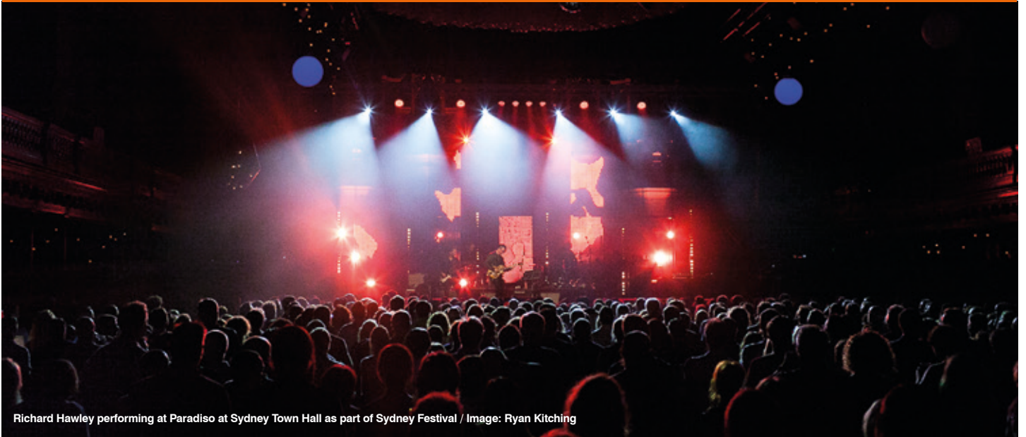
Richard Hawley performing at Paradiso at Sydney Town Hall as part of Sydney Festival