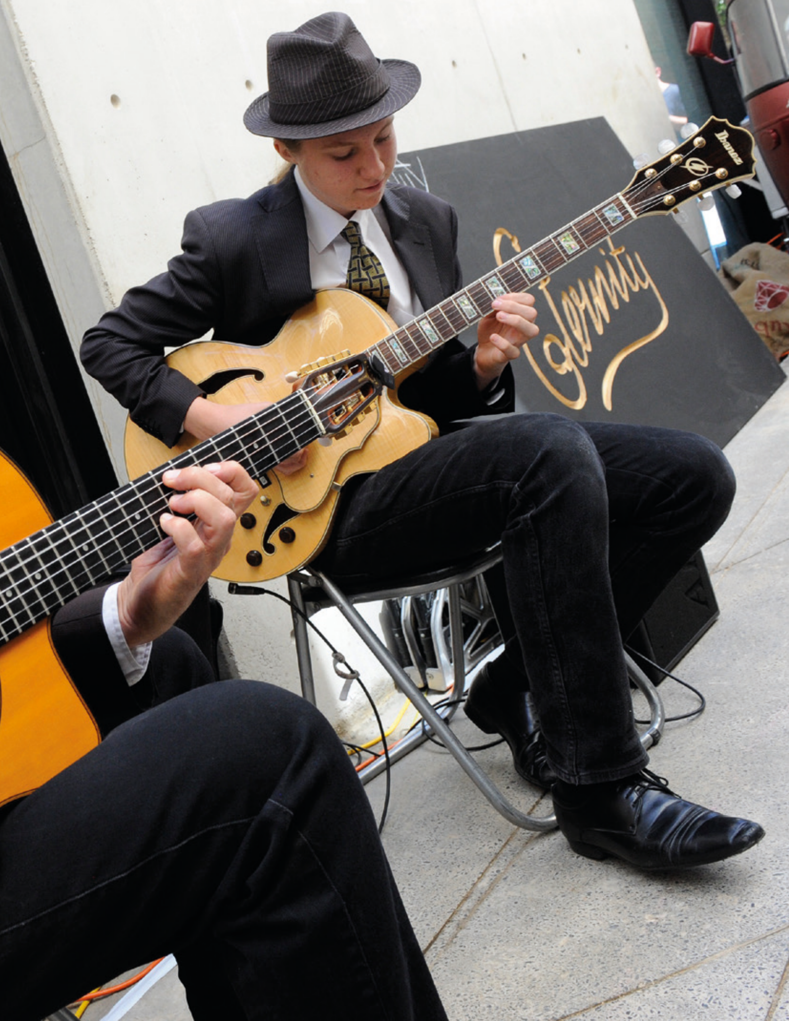
Eternity Playhouse launch / Image: Adam Hollingworth