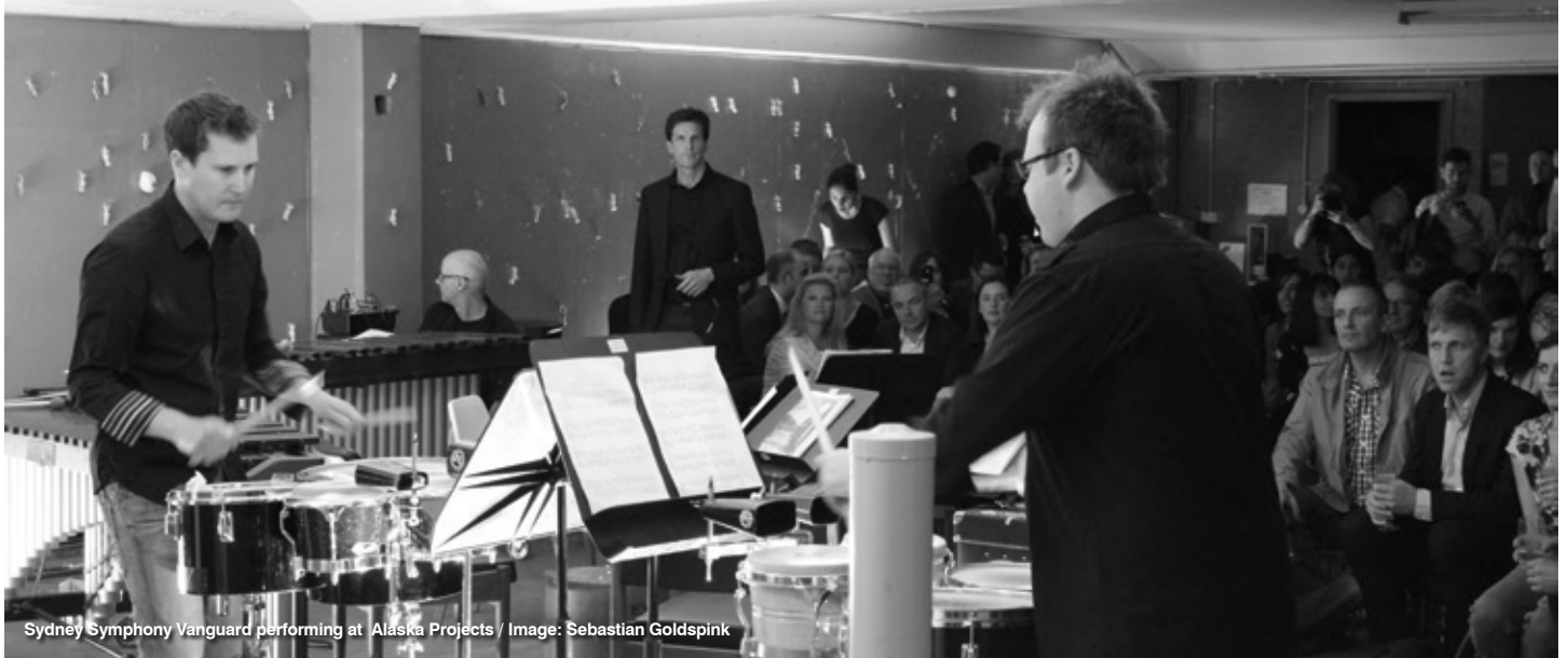
Sydney Symphony Vanguard performing at Alaska Projects

There is also broader concern about the language and inaccessibility of the BCA to anyone other than building consultants, who are sometimes perceived as limiting their advice to a narrow range of 'deemed to satisfy' provisions. Greater transparency about the BCA's intentions might allow a range of alternative solutions to be considered. This issue would also benefit from the creation of an open forum where challenges could be discussed by regulatory bodies and the cultural sector. Currently there are no opportunities for this to occur, and the City will play a vital role in providing a forum for this important policy discussion.