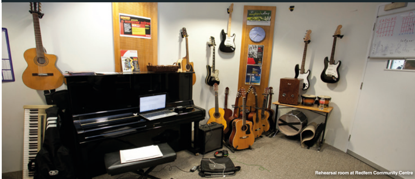
Rehearsal room at Redfern Community Centre