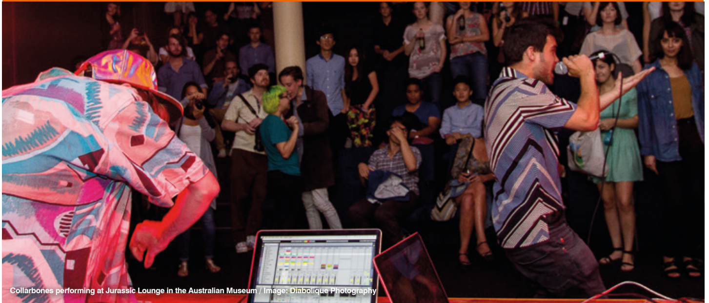
Collarbones performing at Jurassic Lounge in the Australian Museum