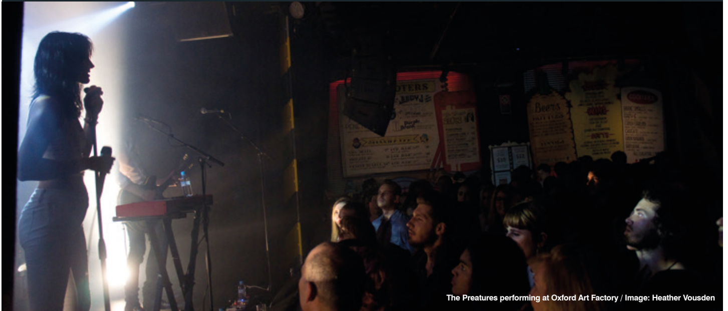
The Preatures performing at Oxford Art Factory