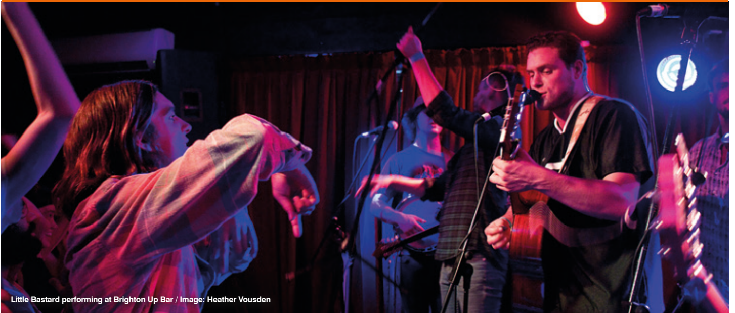
Little Bastard performing at Brighton Up Bar

The City will provide support to buskers not only by identifying opportunities for reducing regulatory complexity, but by playing an active role in their promotion and helping them to connect with retailers and landowners through a central database, website or phone app. In New York, for example, a student project team designed the MUNY (Musicians Under New York) phone app to let New York subway travellers record buskers and tag their locations, see busker profiles, and identify where certain buskers will be playing at particular times. Such technologies not only provide important promotion to buskers, but also allow the general public to engage more actively with public performers and promote the value of busking to a city's cultural life.