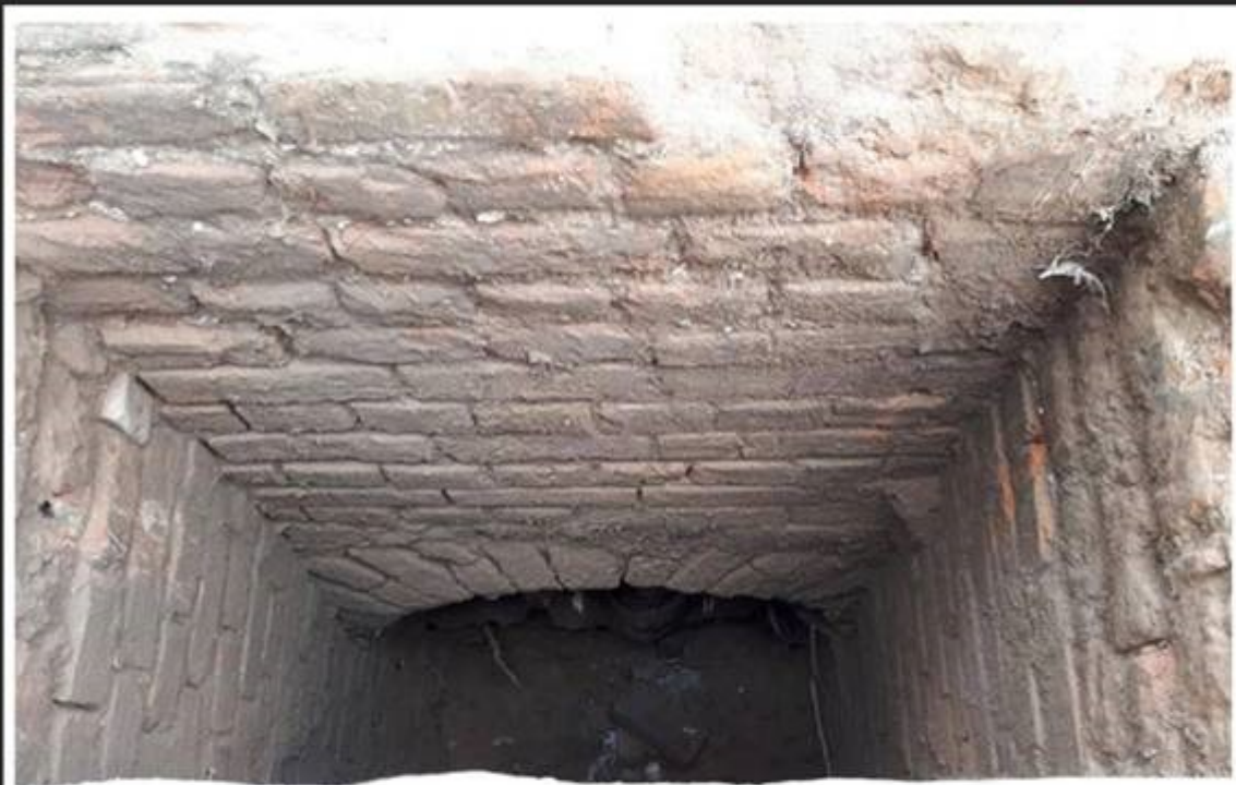
Brick barrel drain pumped out

THIS IS THE FIRST PHOTO OF THE LEGENDARY 1814 "SMUGGLER'S TUNNELS" IN THOMPSON SQUARE