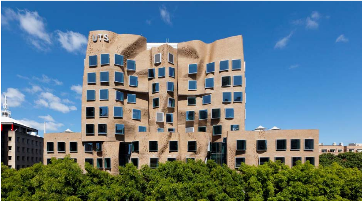
Frank Gehry designed building for UTS Ultimo just south of the Powerhouse Museum's Harwood Building/Stage I

The selected new site in Parramatta has many constraints: far smaller and inaccessible for large objects, visitors and operational requirements alike- the present DJ's car park site is only a quarter size of the existing Ultimo site, 2.23 acres vs. 8.2 acres (approximately).