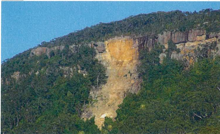
PHOTO: RECENT SLIP ALONG THE FACE OF THE ESCARPMENT AT WOMBARA