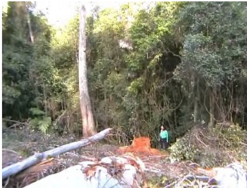
Milton Ulladulla Rainforest EEC South Brooman Cpt 62

The TSL non-compliance register held at the Regional Office has never been completely up-to-date for public inspection, with only up to year 2009 sighted. Registered are thirteen instances of non-compliance in the Eden and Southern regions between 24/3/09 and 1/12/09. Condition 5.8(f) heads the list of breaches, where a harvesting machine entered ridge & headwater habitat, because the unnamed operator was working in steep terrain and as a result his machine slipped on loose rock. There were also three breaches of condition 5.7(h) where the machine entered the filter strip either due to lack of care by the operator, or the operator did not see the marking tape, or even due to the operator having to perform an emergency repair to a second machine...which was where? The classic breach of 2009 was recorded in Yambulla 557, where harvesting of Mapped Old Growth in contravention of condition 5.3(c) eventuated, due to the GPS batteries going flat.