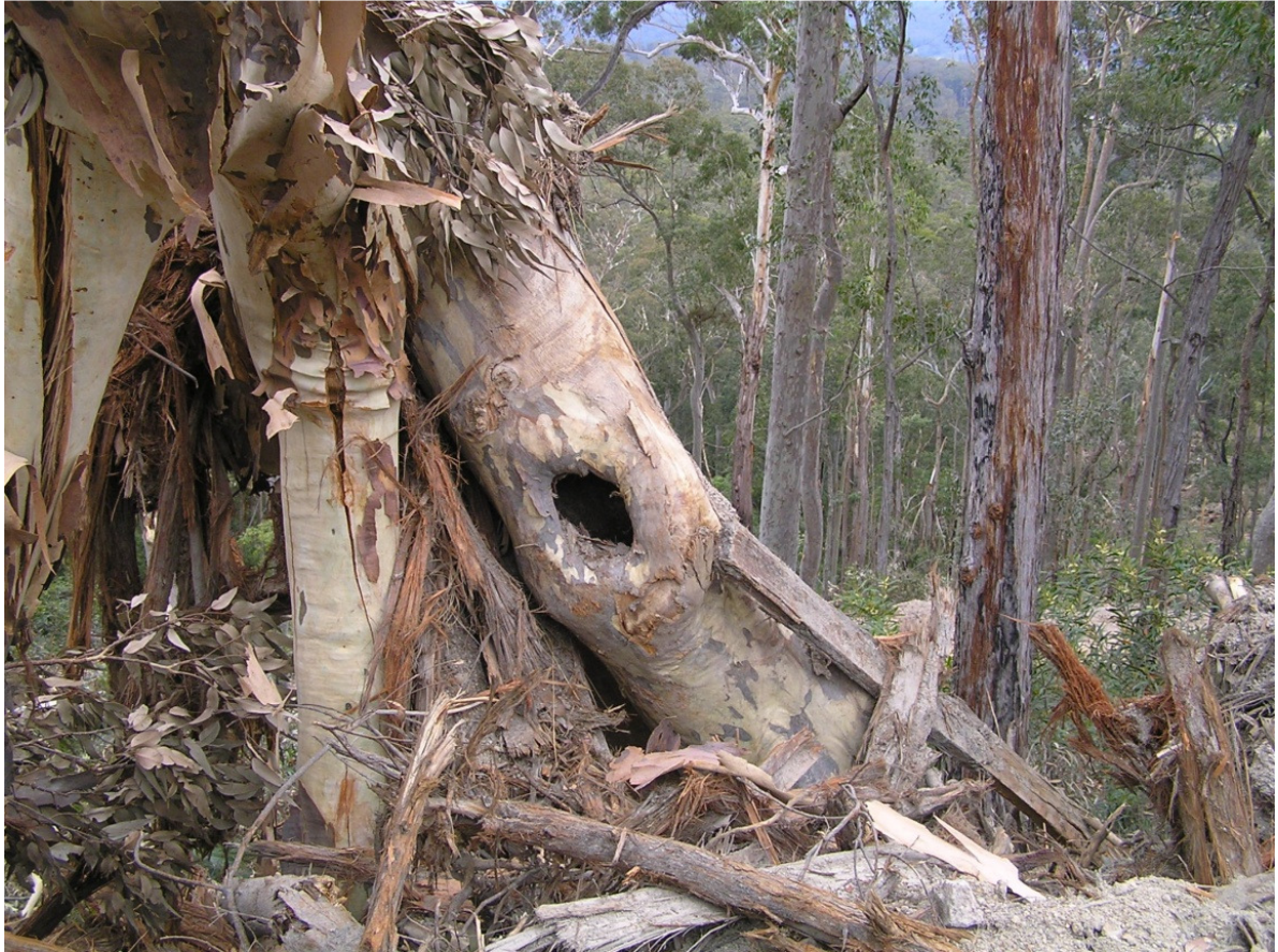
Hollow-bearing tree in Mogo State Forest felled.

There is an obvious disjunction between what the native forestry industry believe is 'best practice' and what independent scientists, academics and eighty percent of the community believe is sustainable. Forests NSW seem to be oblivious to the word 'ecologically'. Given what is now known on greenhouse gas emissions and forest degradation Forests NSW would have difficulty arguing that their practices are sustainable. The loss of species yet to be discovered and carbon sinks will affect future generations.