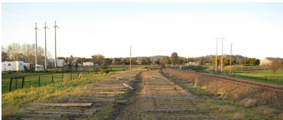
North end of proposed South Cowra intermodal terminal site