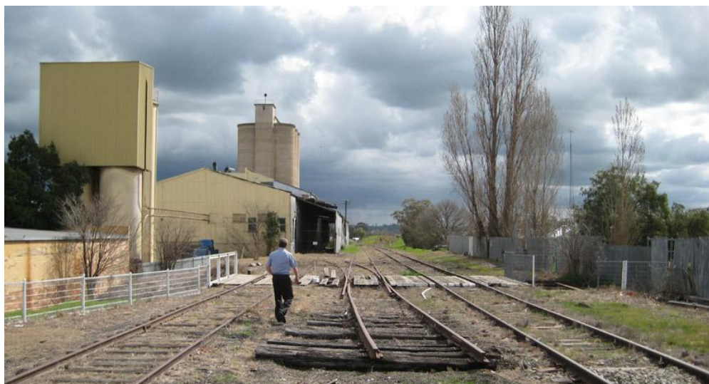
Disused sidings at Young Mill

It is possible that some form of crossing facility will become desirable, both north and south of Cowra. Some sidings that are now derelict may need to be revived (e.g. the Young Roller Mill Sidings), while in other cases some additional trackage may be required to make existing track functional (e.g. a run round loop is likely to be required in the Young area to allow shunting of the Causmag Siding).