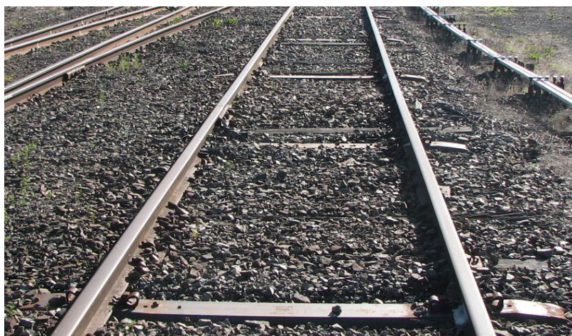
Track with mixed steel and timber sleepers

In general the track between Blayney and Demondrille is in reasonable condition. Rail is predominantly 80 lb/yd (40 kg/m) in 12.2 metre (40 foot) lengths with staggered joints. There is a small amount of 47 kg/m rail (mainly at bridges and through the Carcoar tunnel) and only a small length of track is welded into longer rail sections. Rail on the Greenethorpe branch is 60 lb/yd (30 kg/m) rail as is normal for Class 5 lines. Track condition is adequate with a reasonable number of steel sleepers and some ballast along the length of this line.