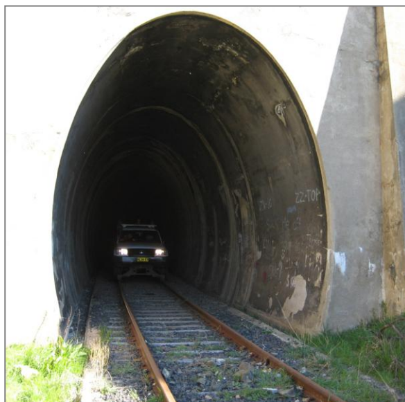
Carcoar tunnel North entrance

There is one tunnel on the line piercing the ridge just south of Carcoar. This tunnel, at 310.6 km, is on a rising grade of 1 in 88 southbound and on a 480 metre radius curve. It is 281 metres long. Track in the tunnel is 47 kg/m rail on good (relatively new) timber sleepers that look to have been installed on a face possibly 8 - 10 years ago. The interior of the tunnel is concrete lined and looks to be quite dry.