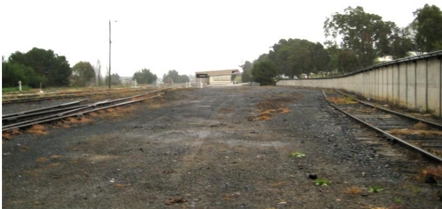
View from the north of proposed temporary intermodal terminal site