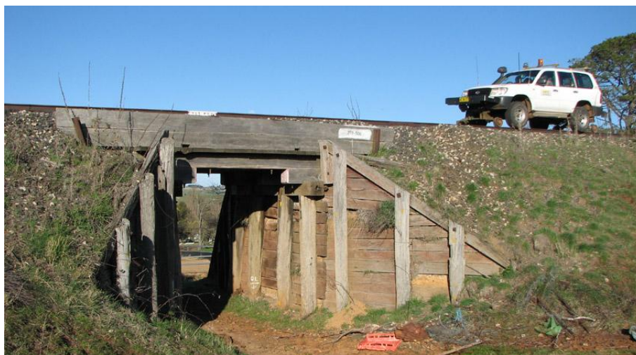
Typical small timber opening at 293.5 km

The curious small opening at 352.49 km (near Westville) has direct rail fixation to timber transoms on steel girders. The 30 transoms are in poor condition and it is recommended that these be fully replaced prior to recommencement of train running, setting this structure up for minimal maintenance for a long period of time. This work is estimated to be in the order of $40,000 which is minor in the overall scheme of things.