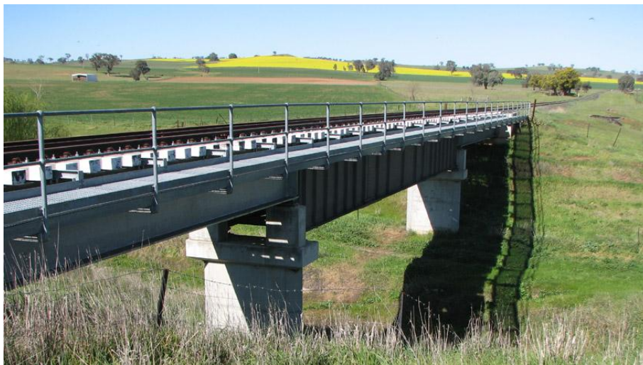
Rebuilt Waugoola bridge