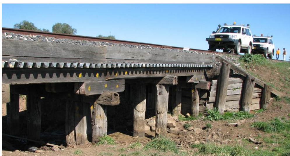
Poor condition of bridge at 349.6 km

Virtually all bridges, apart from the main span over the Lachlan River at Cowra, were originally of ballasted deck timber construction and a considerable number remain in that configuration, with some in relatively poor condition. There has been a program of bridge replacement in steel and concrete, mainly focused on the Cowra – Demondrille section, with a combination of bridging and pipes being used. The remaining timber bridges are listed in Table 3.2 below. Of the 17 timber bridges noted, 10 were in the Blayney – Cowra section, including the largest bridge on the line. However the general observation was that considering the line's location astride the Western Slopes, the number and size of bridges was less than might be expected.