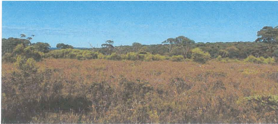
PHOTO: The State protected Dharawal Nature Reserve in the vicinity of where CSG drilling is to occur