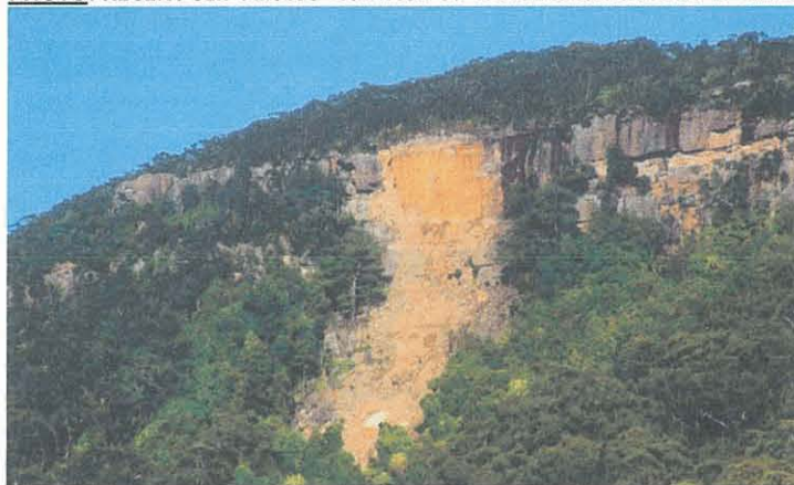
PHOTO: RECENT SLIP ALONG THE FACE OF THE ESCARPMENT AT WOMBARA