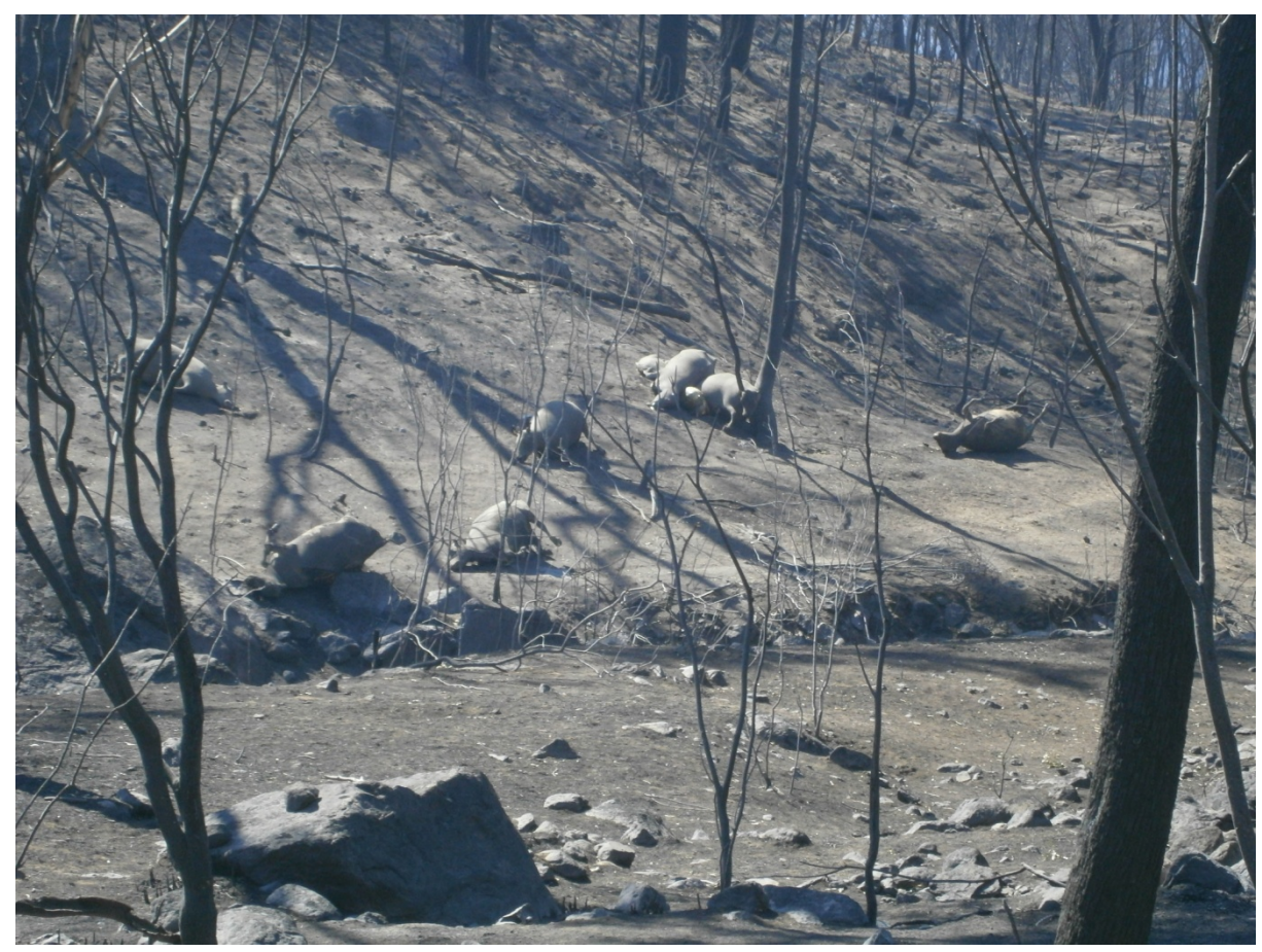
More cows and calves.