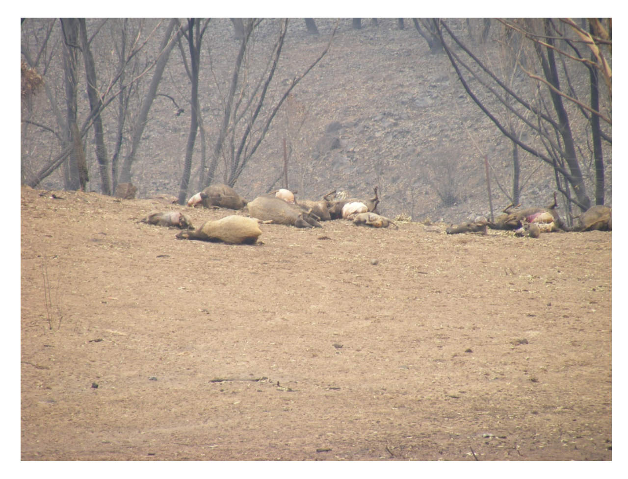
Some of our Dorpers