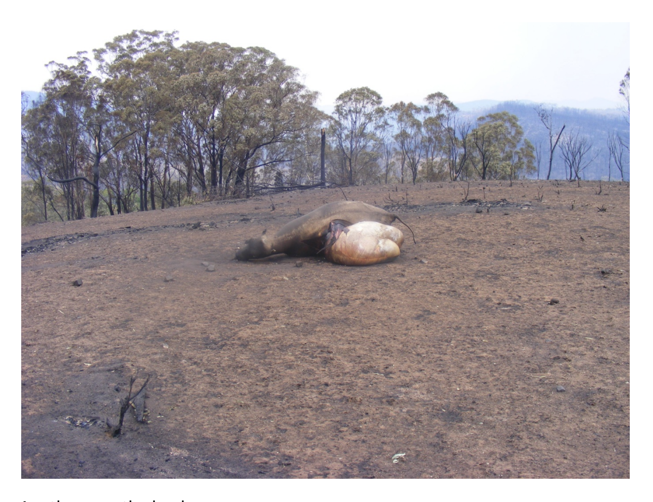
Another cow the landscape.