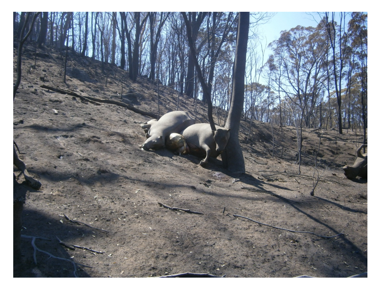
Some more of our cattle.