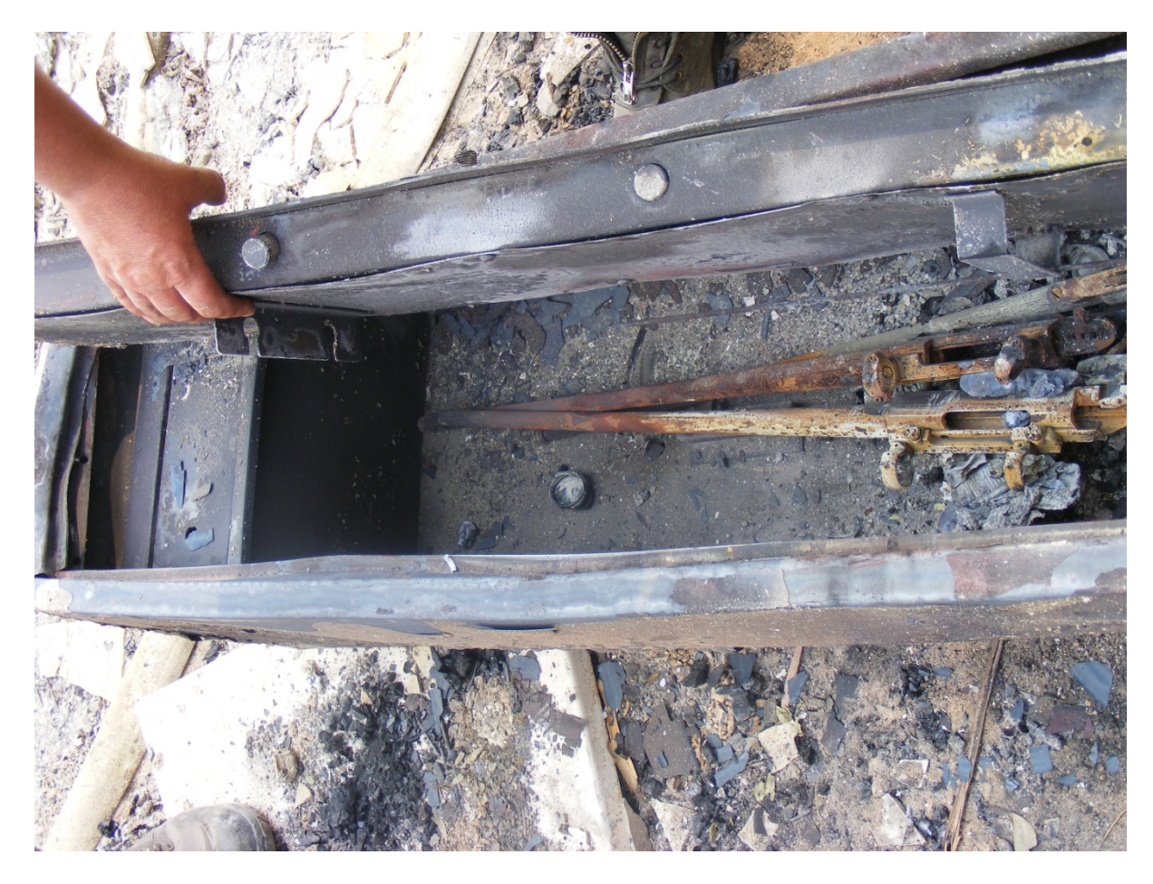
Our gun safe and our firearms.