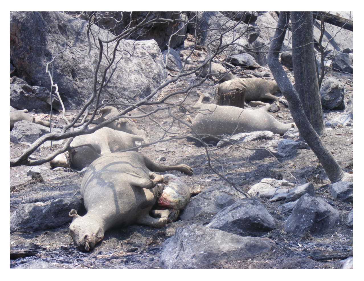
Some of our cattle