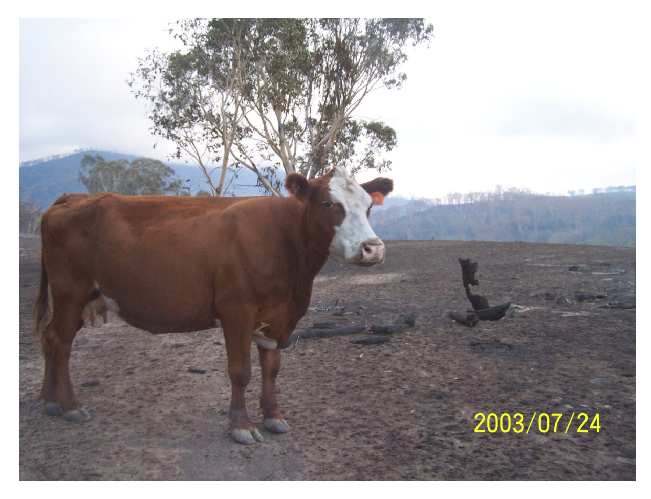
1 of the lucky survivers.