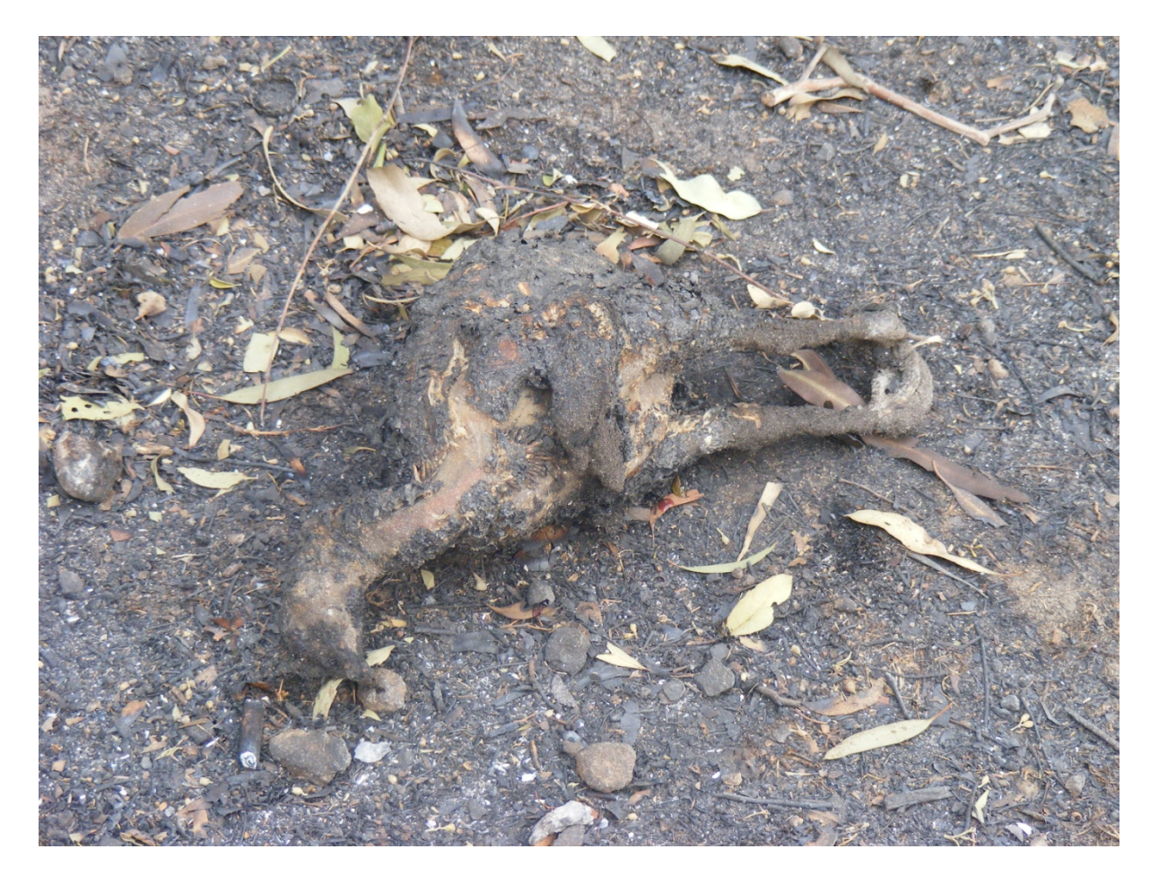
1 of our chooks