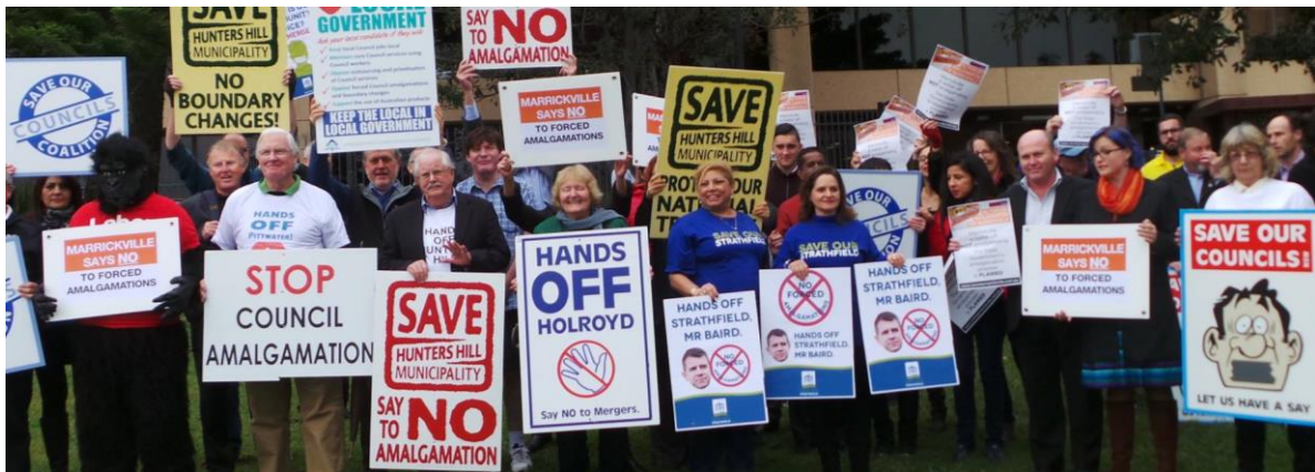
A section of the community groups and councillors that attended with colourful banners and T-shirts the Save Our Councils launch

residents in each council area must give their approval by way of referendum. SHHMC also strongly holds these views.