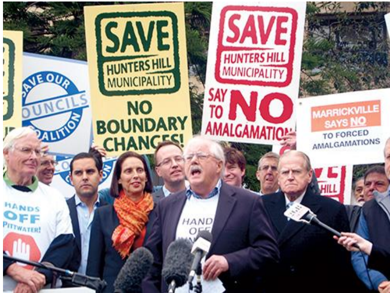
Community addressing the Launch with cross-party political support

d) What the NSW Government is doing in its 'Fit for the Future' proposal, by seeking councils to meet the scale of a Mega Council, and by offering incentives for mergers, is trying to force amalgamations by the back door. Whether it is the back door or the front door this is a direct attack on local democracy and is totally unacceptable to local communities.