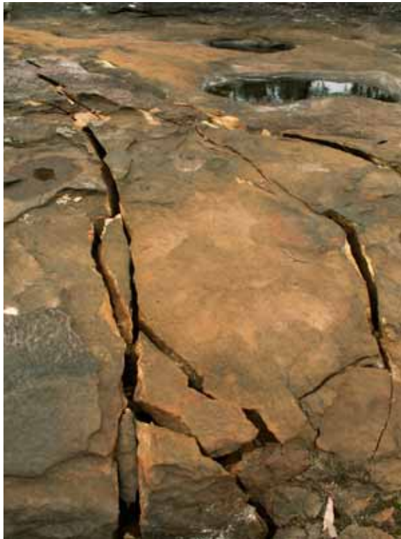
Waratah Rivulet - cracked by longwall mining

The Strategic Regional Land Use Policy does not specifically mention mining in designated water supply catchments. This issue is of particular concern in the Southern Coalfield where numerous longwall mines exist within the Sydney Catchment Authority (SCA) administered Special Areas but also arises in the Western Coalfield around Lithgow. Under its governing act the SCA is required to ensure that any development in the Special Areas is of "neutral or beneficial" impact and public access is prohibited. In theory this gives Sydney some of the strongest water supply catchment protection mechanisms in the world.