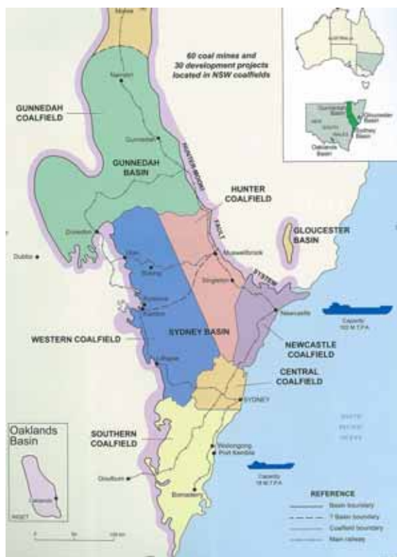
NSW Coal Titles

In 2011 the incoming Coalition Government decided to keep the strategy process in place. They face an enormous challenge and a diversity of issues across all coalfields, along with an expectation from farmers, environmentalists and local communities both remote and urban that the pendulum will swing back. Prior to the 2011 NSW Election the coal industry was in damage control. Its strategy was familiar – land to be set aside as coal reserves (via Strategic Regional Land Use plans), increased community liaison and information flow, and to advocate the philosophy that mining and agriculture can coexist.