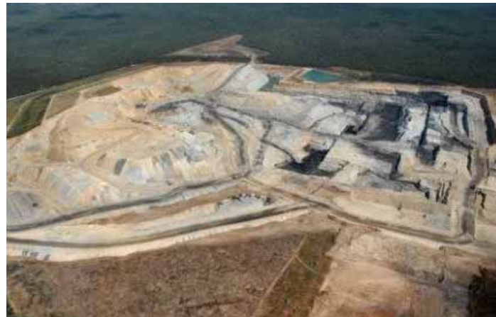
Mining of Leard State Forest - much more is proposed

The new government faces some important early tests of its commitment to improve regional planning. Environment groups applauded the stance taken by the Coalition on proposed longwall mining in the Wyong water supply catchment and Dharawal State Conservation Area. However in regard to important natural areas the Strategic Regional Land Use Policy remains ambiguous. The policy does not contain a clear approach to river and wetlands protection which was a critical policy failure of the previous government. These concerns have been articulated in recent meetings with government.