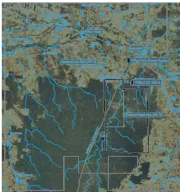
Pilliga - current proposed CSG development

Another problematic aspect of Coalition policy is the promotion of Traveling Stock Routes (TSRs) for gas pipeline installation and the establishment of energy transport corridors. TSRs are extensive corridors of vegetation gazetted prior to clearing to facilitate the droving of stock. Unlike the lands making up the conservation estate, many TSRs traverse low-lying and ecologically productive areas, and comprise several threatened ecological communities, such as critically endangered Grassy Box Woodlands.