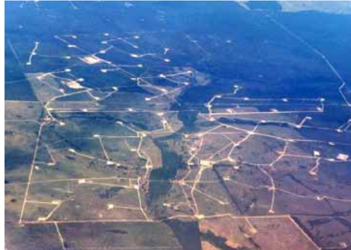
Chinchilla, Qld - typical landscape coverage of coal seam gas mining

For two years Queensland environment groups have been campaigning against open cut coal mines on agricultural land and environmentally sensitive areas. There have since been more recent demands for a moratorium on further coal seam gas developments.