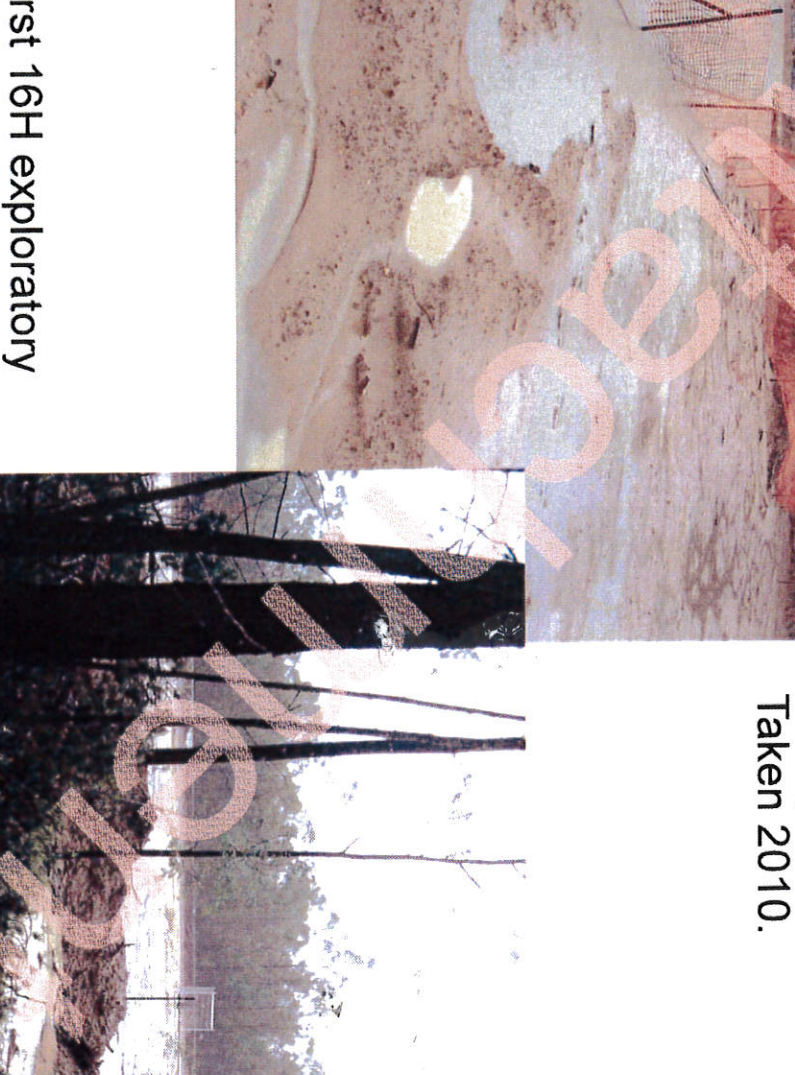
Photo 10. Dewhurst 16H, exploratory corehole. Unlined drill pond overflowing on private land during rain event in the Pilliga. Taken 2010.

Photo 11. Dewhurst 16H exploratory corehole. Drill pond and wellpad flooding on private land during rain event in the Pilliga. Taken 2010.