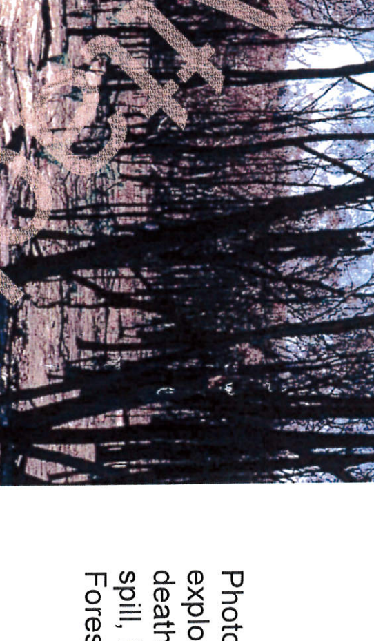
Photo 12. Bohena 2D exploratory corehole. Tree deaths from saline water spill, Pilliga East State Forest. Photo taken 2002.

Photo 13. Bohena 2D exploratory corehole. Tree deaths from earlier saline water spill. Photo 2011. Pilliga East State Forest.