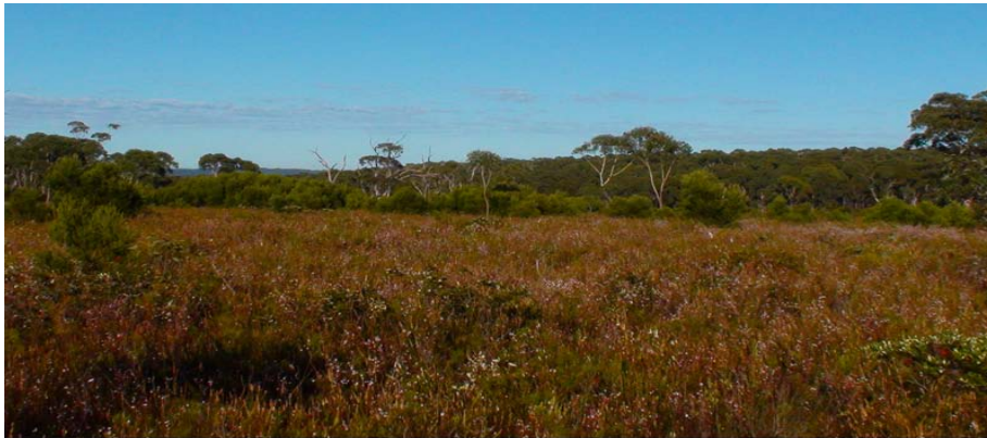
PHOTO: The State protected Dharawal Nature Reserve in the vicinity of where CSG drilling is to occur