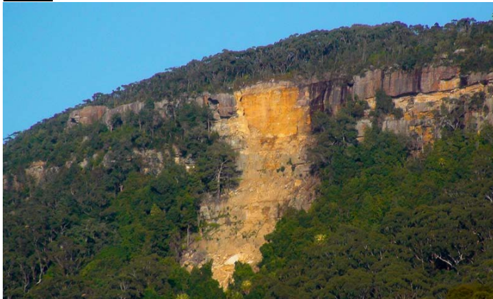
PHOTO: RECENT SLIP ALONG THE FACE OF THE ESCARPMENT AT WOMBARA