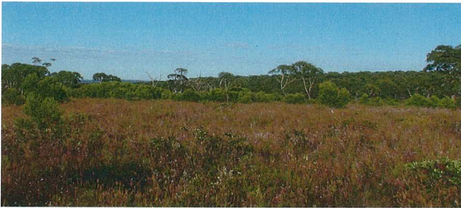
PHOTO: The State protected Dharawal Nature Reserve in the vicinity of where CSG drilling is to occur