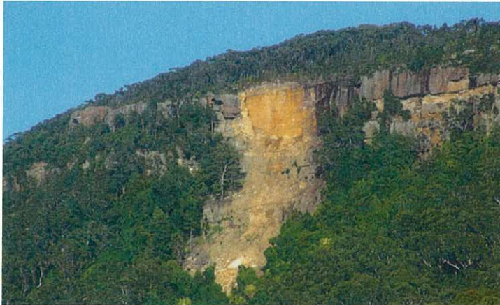
PHOTO: RECENT SLIP ALONG THE FACE OF THE ESCARPMENT AT WOMBARA