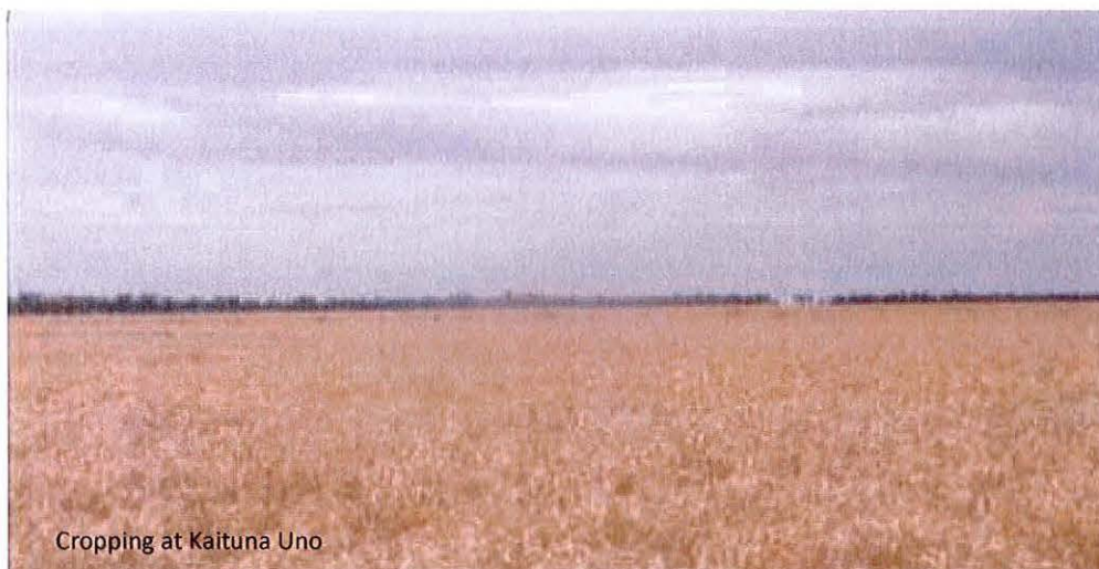
Cropping at Kaituna Uno

The success of any enterprise is reliant upon strong leadership and governance. The strong leadership and governance of Aboriginal Land Councils will remain the foundational focus of this policy.