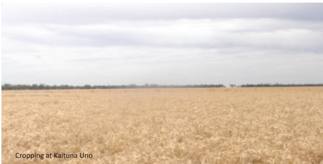
Cropping at Kaituna Uno

The success of any enterprise is reliant upon strong leadership and governance. The strong leadership and governance of Aboriginal Land Councils will remain the foundational focus of this policy.