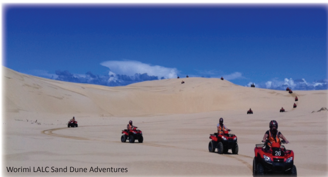
Worimi LALC Sand Dune Adventures

The NSW Aboriginal Land Council will continue to explore other business enterprise opportunities.