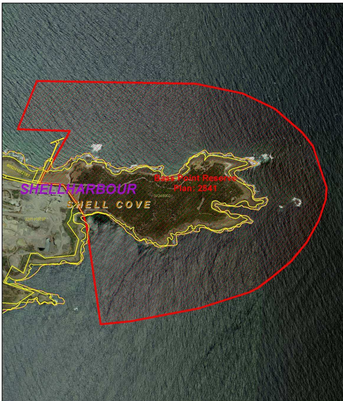
State Heritage Register - Recommended Curtilage