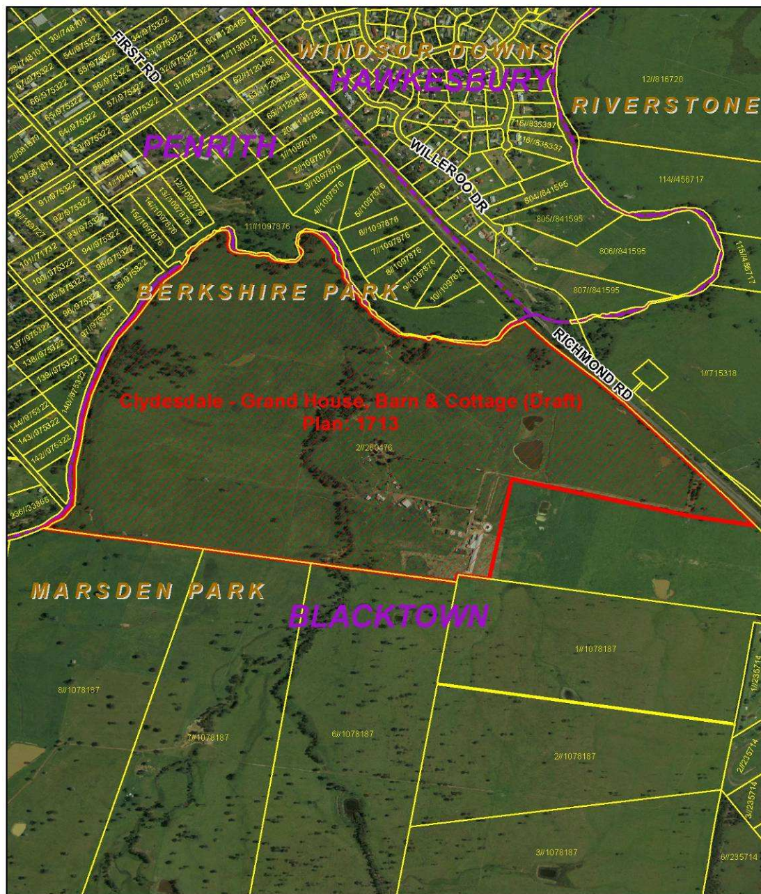
State Heritage Register - Proposed Curtilage for Investigation