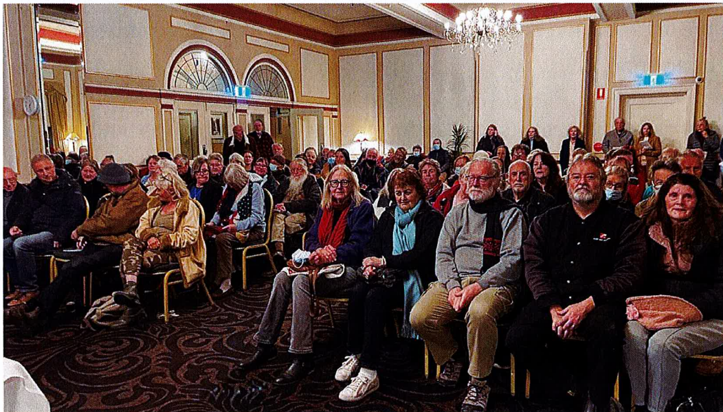
📷 Residents gather at the Carrington Hotel in Katoomba to respond to the RSPCA's announcement about the closure of its Katoomba shelter.

Residents concerned at the closure of the Katoomba RSPCA shelter have called on the state organisation to return it to the local community which built it.