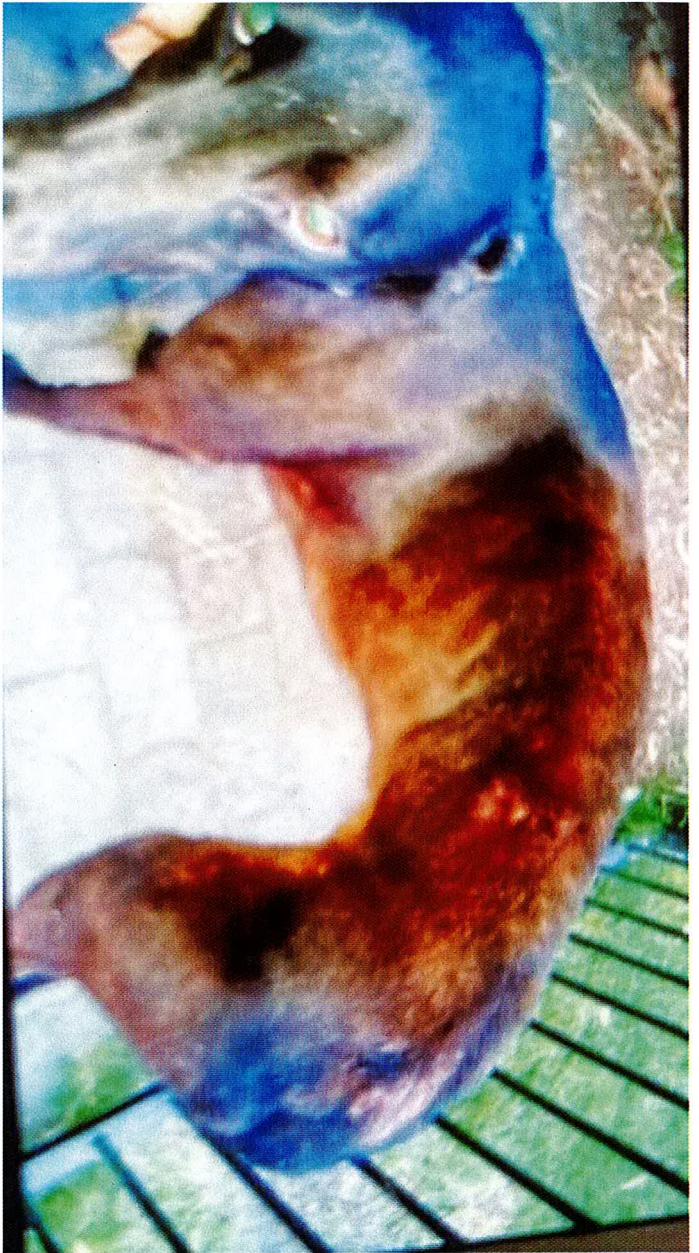
Starved and dumped