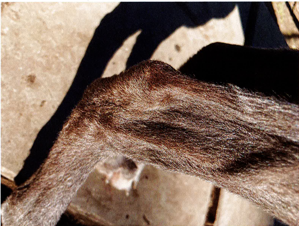
Untreated fractured hock