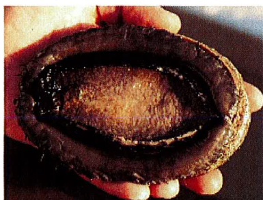
Figure 1: Healthy abalone

AVG affects the nervous system of abalone and symptoms include swollen mouthparts, curling of the foot resulting in exposure of shiny edges of the shell, difficulty adhering to surfaces, and lethargy, often causing death.