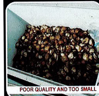
POOR QUALITY AND TOO SMALL

Report to Fishers Watch on 1800 043 536 or online at www.dpi.nsw.gov.au/fishing/report-illegal-activity