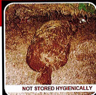
NOT STORED HYGIENICALLY