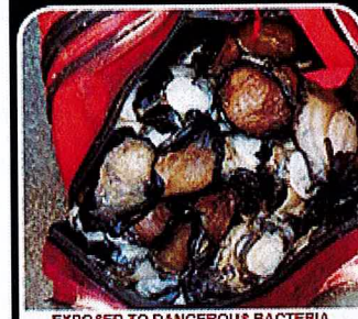
EXPOSED TO DANGEROUS BACTERIA