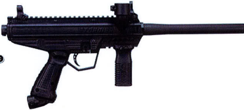
TIPPMANN SPORTS Model Stormer Version 1 - paintball marker - OK