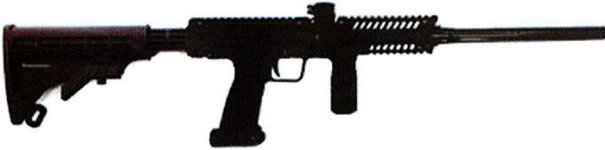
Tippmann model Stormer Basic Marker – Black – paintball marker - OK