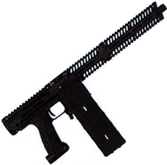
EMEK EMF100 PAINTBALL MARKER