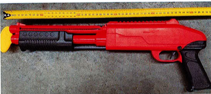
PLANET ECLIPSE Model Emek Variant 3. – imitation firearm