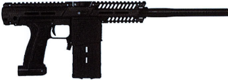
PLANET ECLIPSE Model Emek Version 4. – EMEK EMF100 – imitation firearm