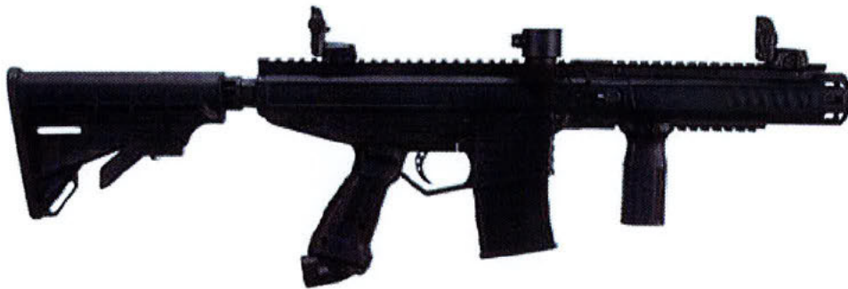
TIPPMANN SPORTS Model Stormer Version 3. – imitation firearm