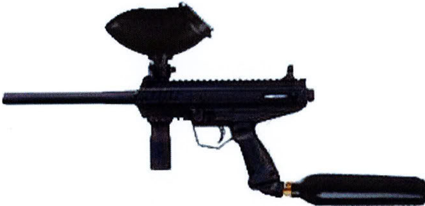
JT Model Splatmaster - imitation firearm