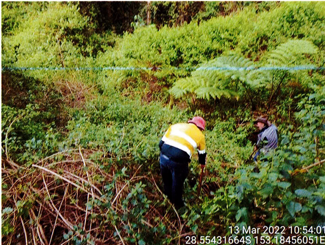
Telstra field staff searching for a land-slip (likely 20-30cm in length) in dense bushland at Blue Knob, approx. 6 km NW of Nimbin, NSW.