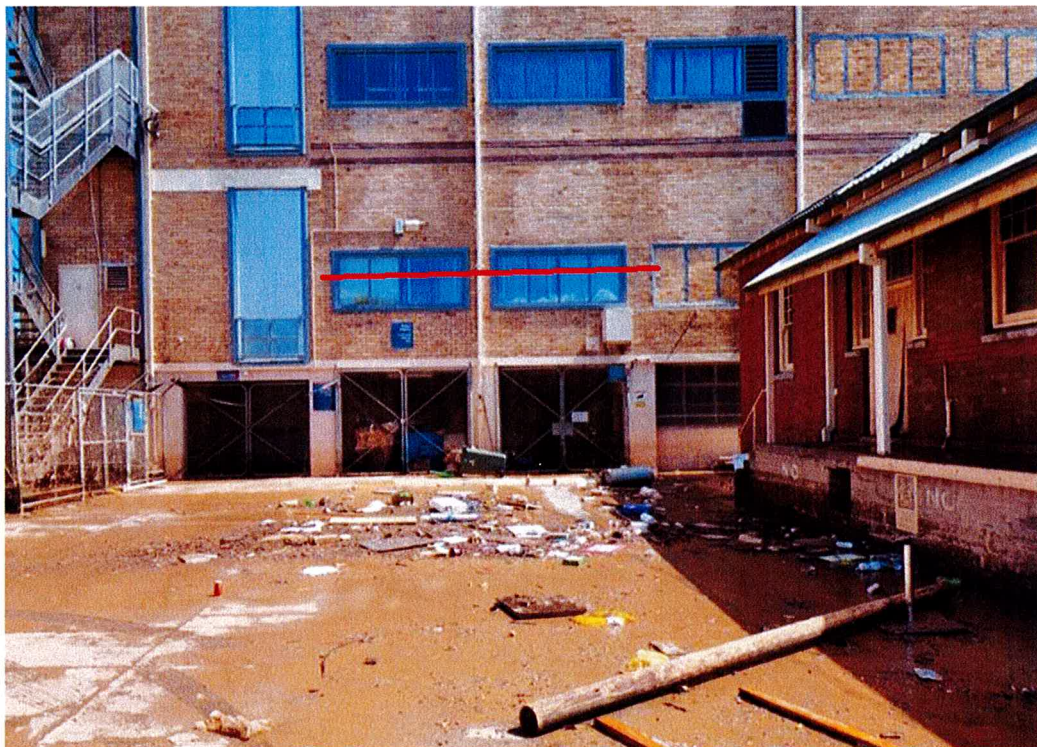
Lismore Exchange after flood waters had receded. The red line shows the high-water mark.