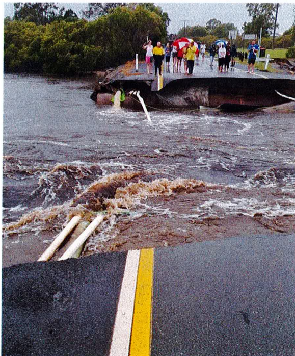
Damaged fibre duct alongside a washed-out bridge, NSW/Qld border region.