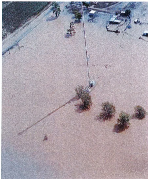
Aerial view of the inundated mobile base station at Buckendoon.