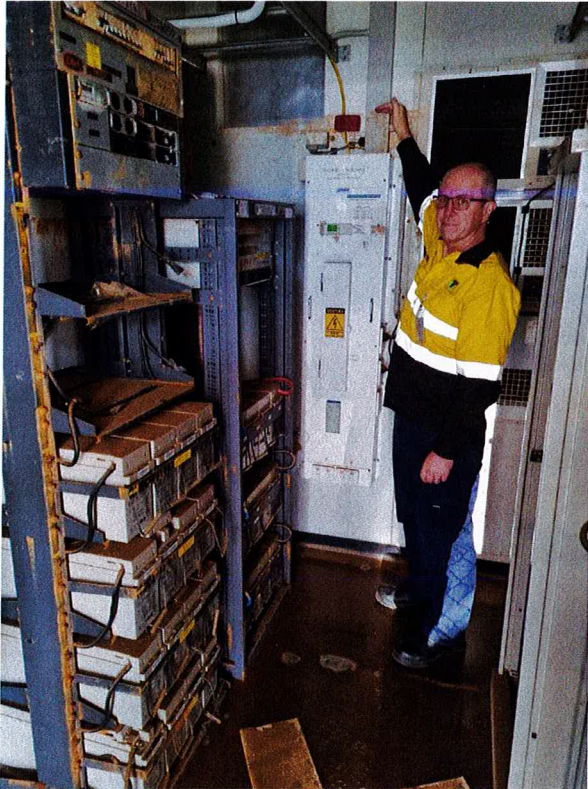
Telstra technician showing the height flood waters reached inside a mobile base station.