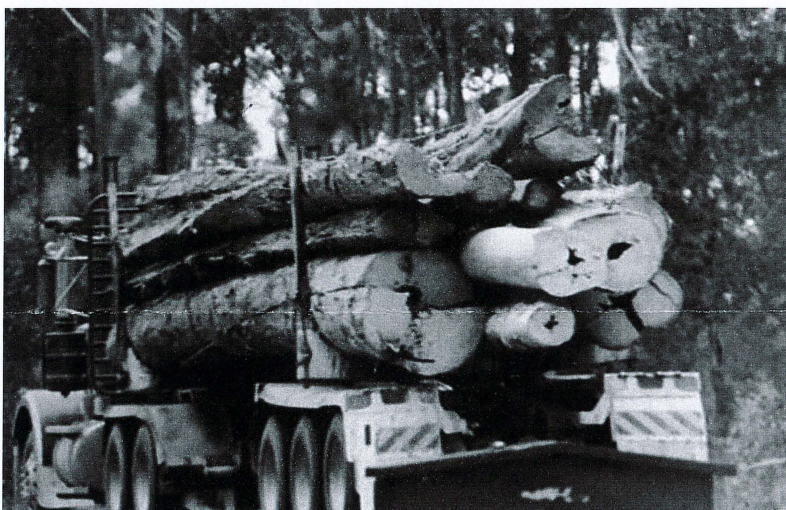
Public native forest hardwood logs are mainly exported as woodchips