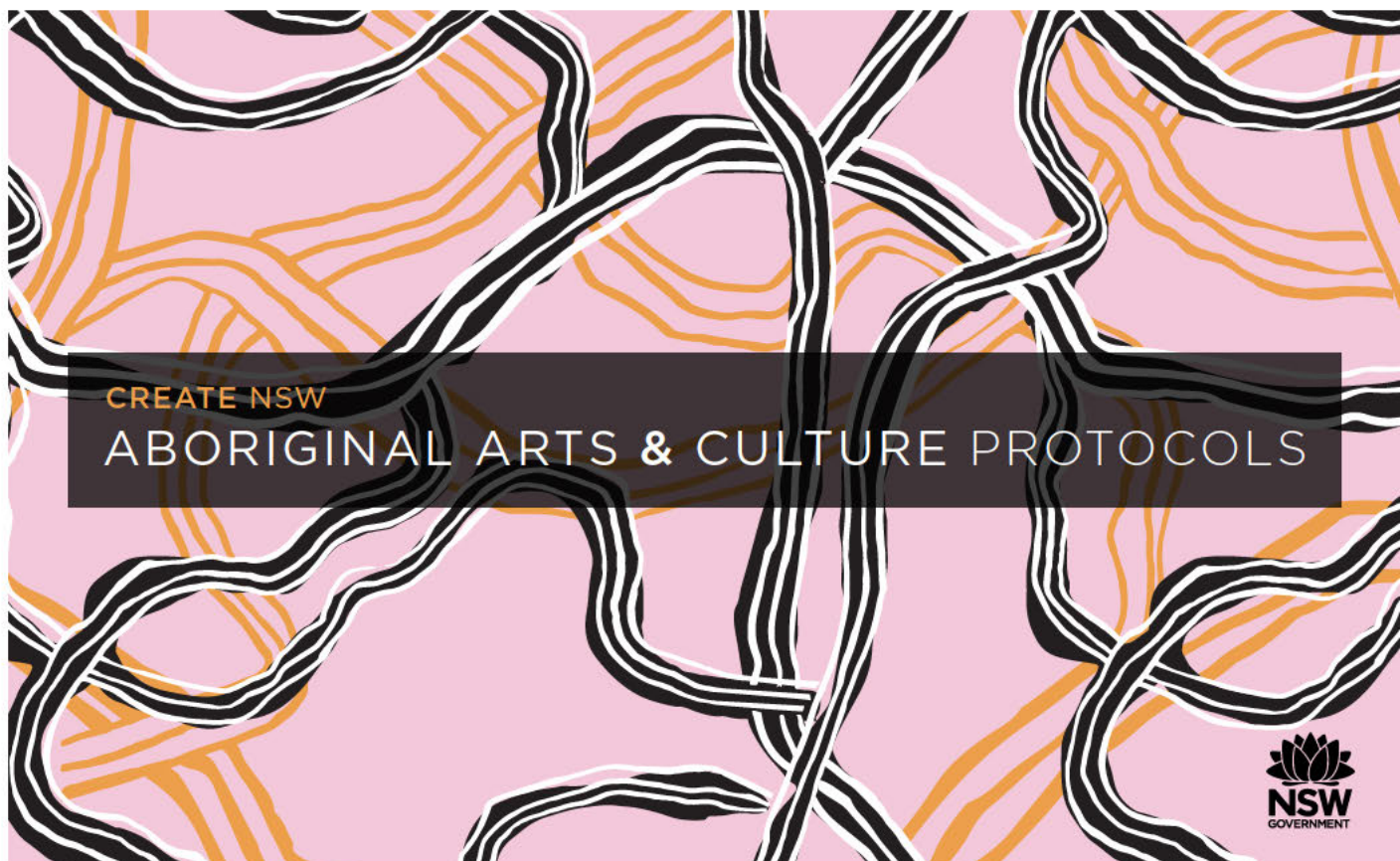
Cover of the Create NSW Aboriginal Arts & Culture Protocols featuring Warruwl by Lucy Simpson.