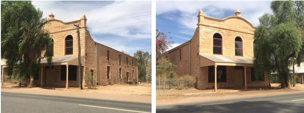
AFTER AND ONGOING PHOTOS OF THE BOND STORE – repaired roof, new windows, verandah, upgraded interior