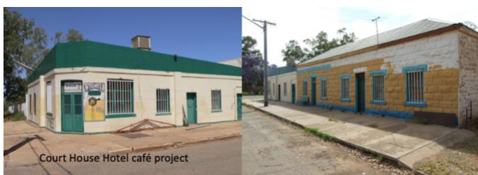
Court House Hotel café project