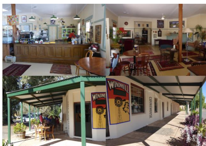
Internal photos of former café

Before – above , After verandah reconstruction and Building repairs including roofing, stone work etc