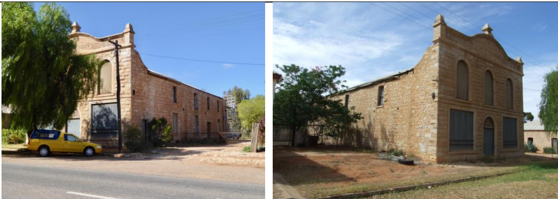
BEFORE PHOTOS OF THE BOND STORE, REID ST, WILCANNIA – note leaking roof, boarded up windows