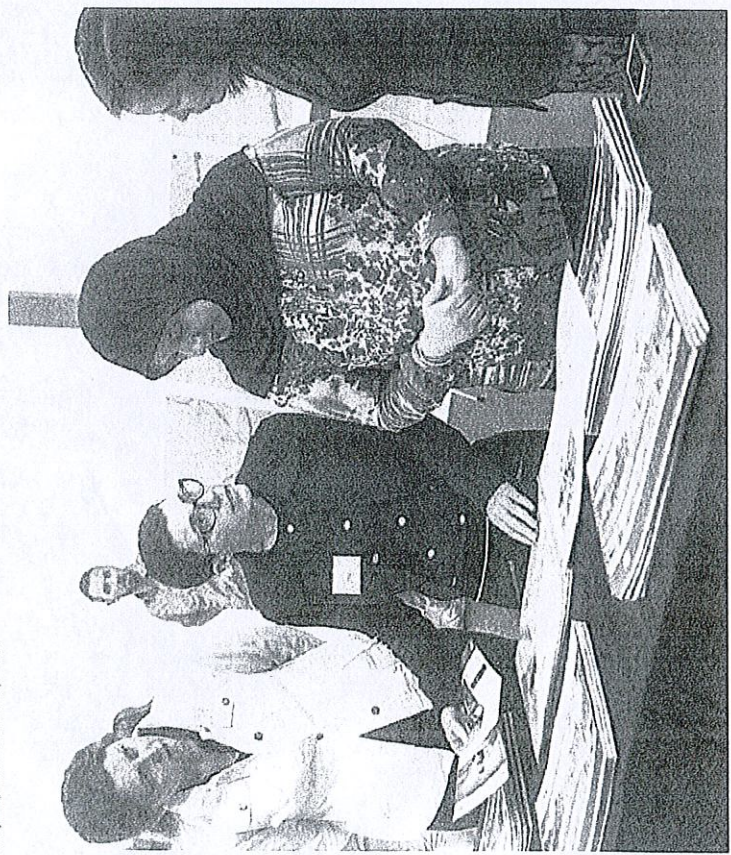
A Sydney Metro community event.

The Sydney Metro West project team will develop detailed planning and environmental assessment documents for further public consultation and community engagement.