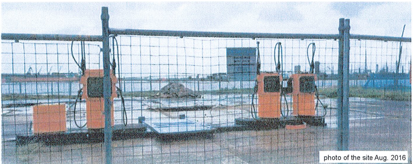
photo of the site Aug. 2016

Today it stands as a fenced off eyesore. It has been in this state since the fire, over 7 months ago.