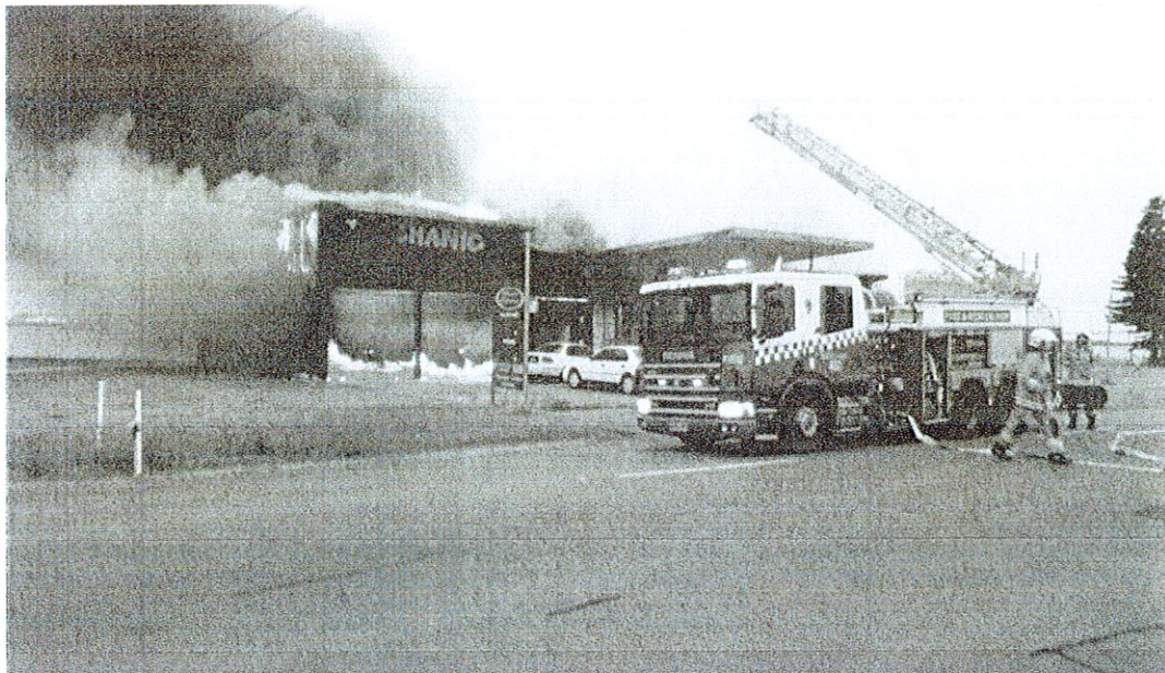
GUTTED: Fire destroyed controversial Stockton service station Rose's Garage on Saturday night. Police are treating it as suspicious.

A STOCKTON service station, at the centre of a long-running dispute between residents and its recalcitrant operator, has burned to the ground in suspicious circumstances just two weeks after Crown lands revoked the lease.