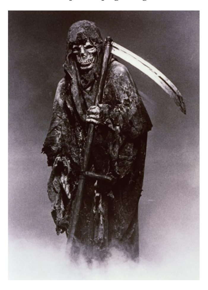
Figure 1 Grim Reaper campaign image<sup>19</sup>