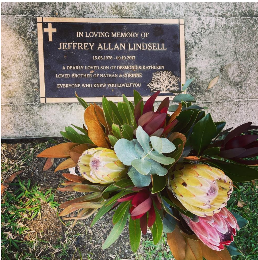
4 Jeffrey's resting place