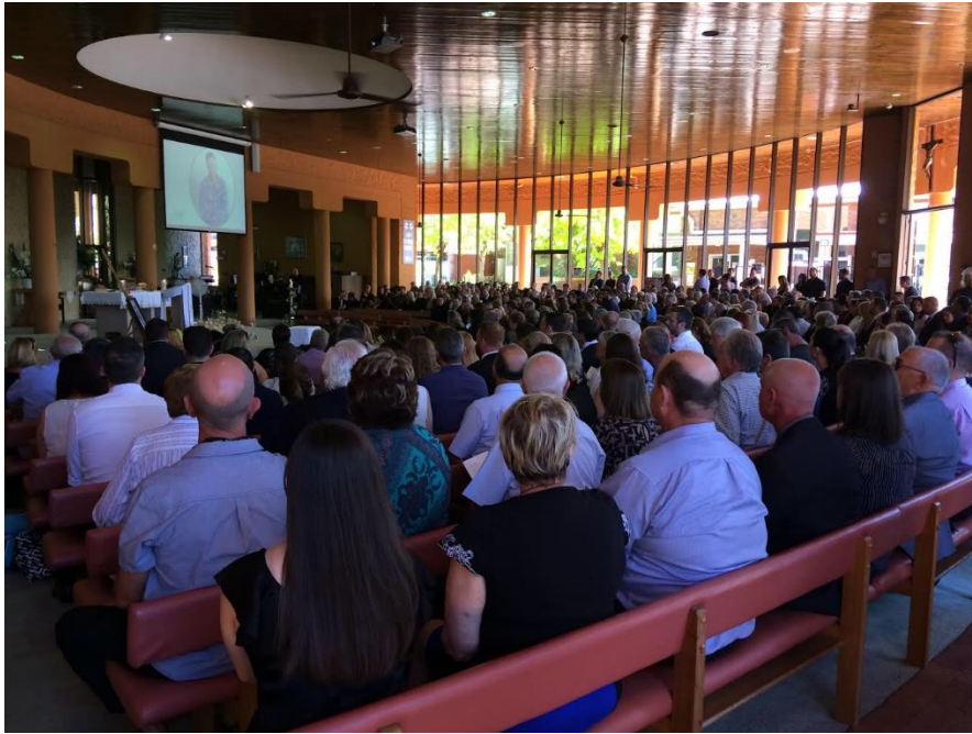
3 A photo of the people gathered at Jeffreys funeral 19th October 2017