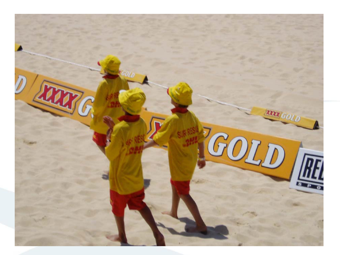
Exposure to alcohol advertising beings early