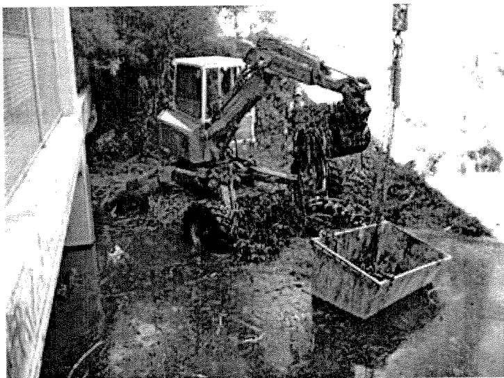
Spider excavator clearing silt in creek.