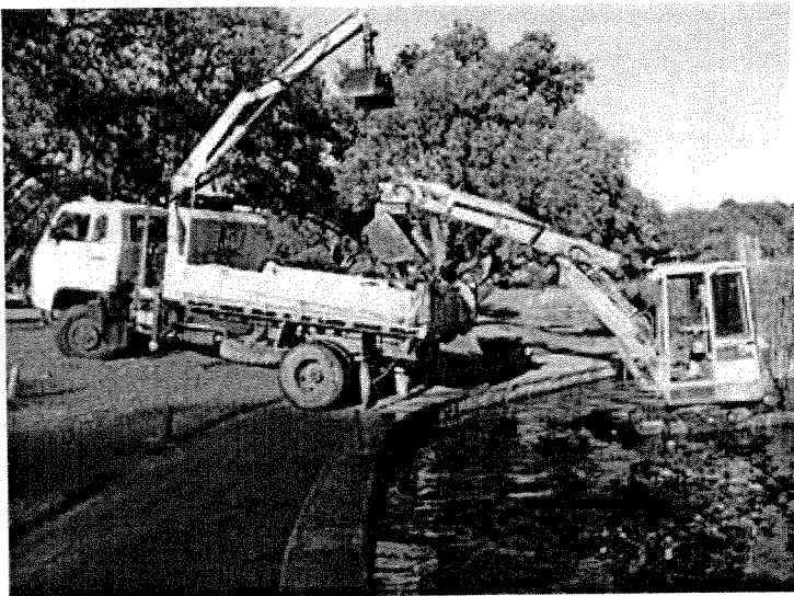
Spider excavator loading weed into truck.

StormWater Systems ABN 55 075 844 816 Telephone (02) 9555 8744