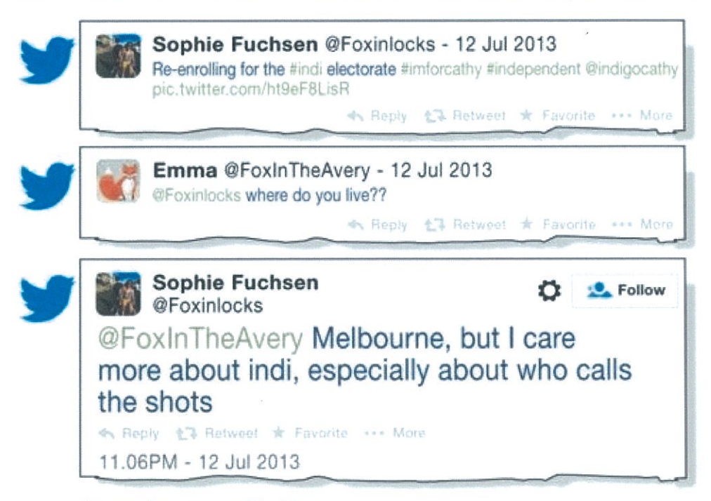
An exchange on Twitter